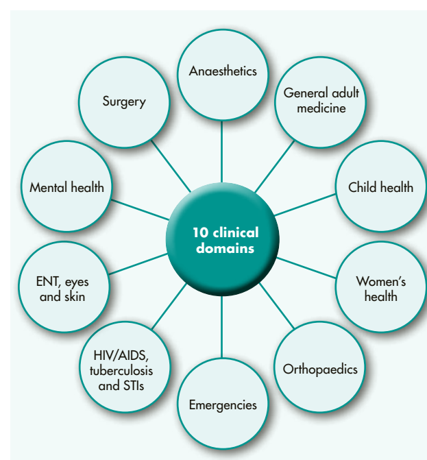
Figure 2: Clinical domains included in the training of South African family physicians