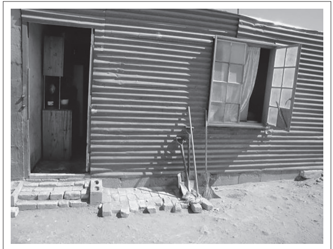
FIGURE 1: Example of rudimentary dwelling.