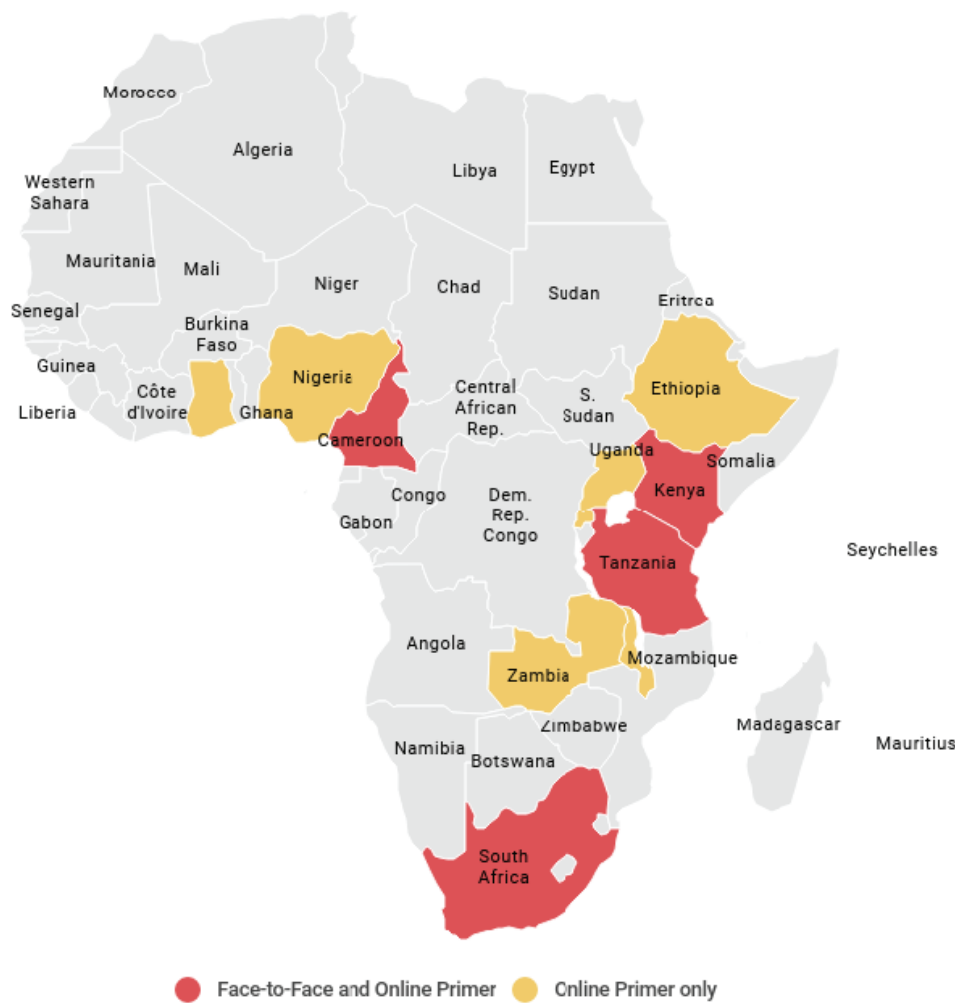
Figure 1 Geographical distribution of face-to-face Primer in Africa and distribution of online only participants (2014–2019).

paper, we share our experiences and the lessons we learnt when migrating a face-to-face workshop to an online learning space by general academics, using our experience in the Primer in SRs as a case study.