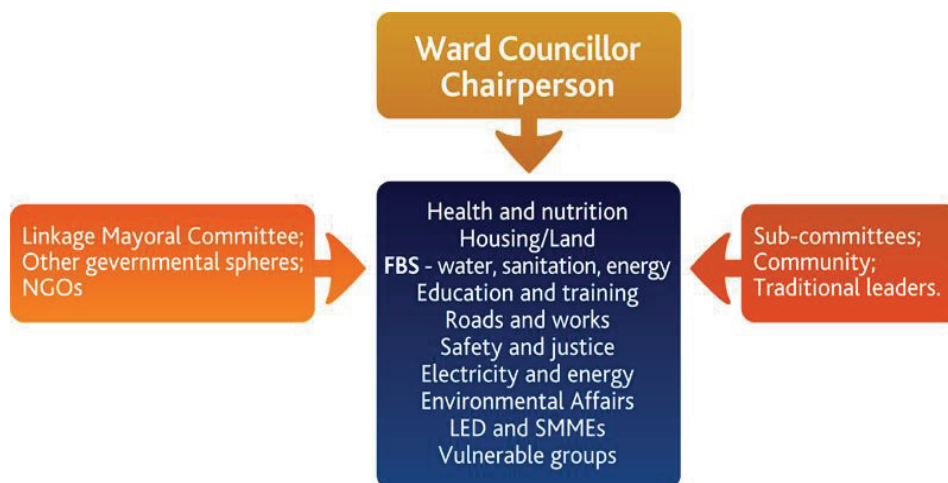
Figure 2: Areas covered by Ward Committees and their linkages