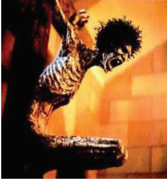
The Tortured Christ

obviously screaming, the image of utter despair, recalls the crucified Lord. It gives a glimpse into the sense of hopelessness and despair that was experienced on the cross.