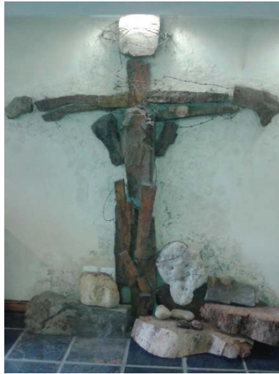
The Disfigurement of Suffering

Firstly, the sculpture is titled “The Disfigurement of Suffering”. The symbols used are explained 23 in the following manner. “The sculpture of rock can represent either a cross or a human body torn apart by suffering. In front of the cross/body, one becomes aware of the fact that Christ did not die ‘on’ a cross. On the contrary, it was the curse of the cross, the woundedness, the guilt and sin of human beings that killed the suffering Christ. The suffering is a divine act: ‘For our sake he made him to be sin, so that in him we might become the righteousness of God’ (2 Cor. 5:21). In this cross there is no face. According to Isaiah 53:2 the suffering servant of God had no attractiveness at all, nothing to make us want him.