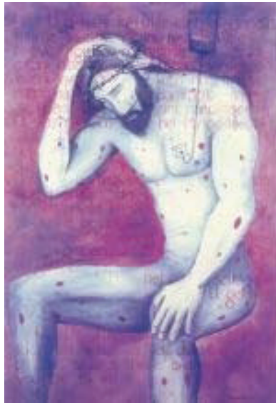
Man of Sorrows: Christ with Aids 26

Another painting that portrays brokenness is that of W Maxwell Lawton, namely Man of Sorrows: Christ with Aids . The painting was commissioned by Archbishop Desmond Tutu to mark his new AIDS ministry 24 in South Africa. It was first exhibited in the St George’s Anglican Cathedral in Cape Town in 1994 and since then has been taken throughout South Africa and seen by approximately 4 million people. 25