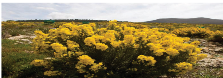
Figure 1. Honeybush plant in flower.

as a flavourant and colouring agent in a number of food applications. Honeybush ( Cyclopia spp.), another member of the fynbos biome, is a bushy shrub found between the Piketberg area in the West, and Port Elizabeth in the East of South Africa ( Figure 1 ). The year 1996 welcomed the first commercial harvests for honeybush, followed by the establishment of the South African Honeybush Tea Association (SAHTA) to manage the farming and sustainability practices as well as commercial interests of honeybush. After harvesting of rooibos or honeybush crops, leaves and stems are cut into small pieces, moistened and are fermented, either on open heaps or alternatively for honeybush also using an oven or fermentation tank. This is followed by drying of the fermented rooibos or honeybush. Fermentation of these plants is however associated with a change in phenolic composition as well as colour compared, to the green or unfermented plants which undergoes considerably less oxidation [42, 43]. The main contributors to the commercial market out of the 24 species of Cyclopia are C. intermedia , C. genistoides and C. subternata . C. intermedia has the largest market share; however, it is harvested from the wild, making the future sustainability and profitability of the crop problematic [44]. Honeybush is a budding commercial interest, used mainly as a tisane with great potential for development and is exported to countries such as the Netherlands, Germany and Japan [45].