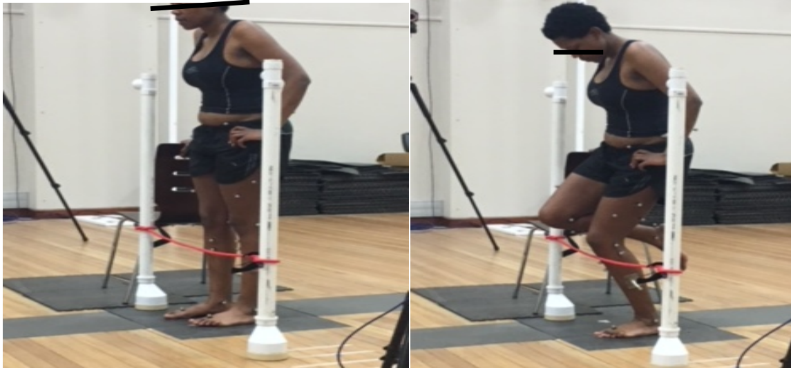
Figure 3.2 Joint position testing in a weight bearing position, SLS