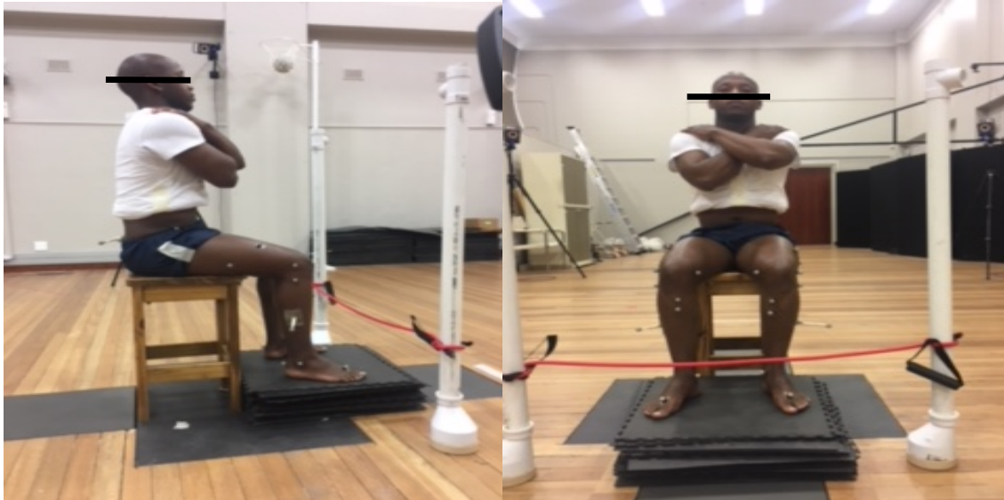
Figure 3.3 Joint position sense testing in sitting (frontal view and Lateral view)