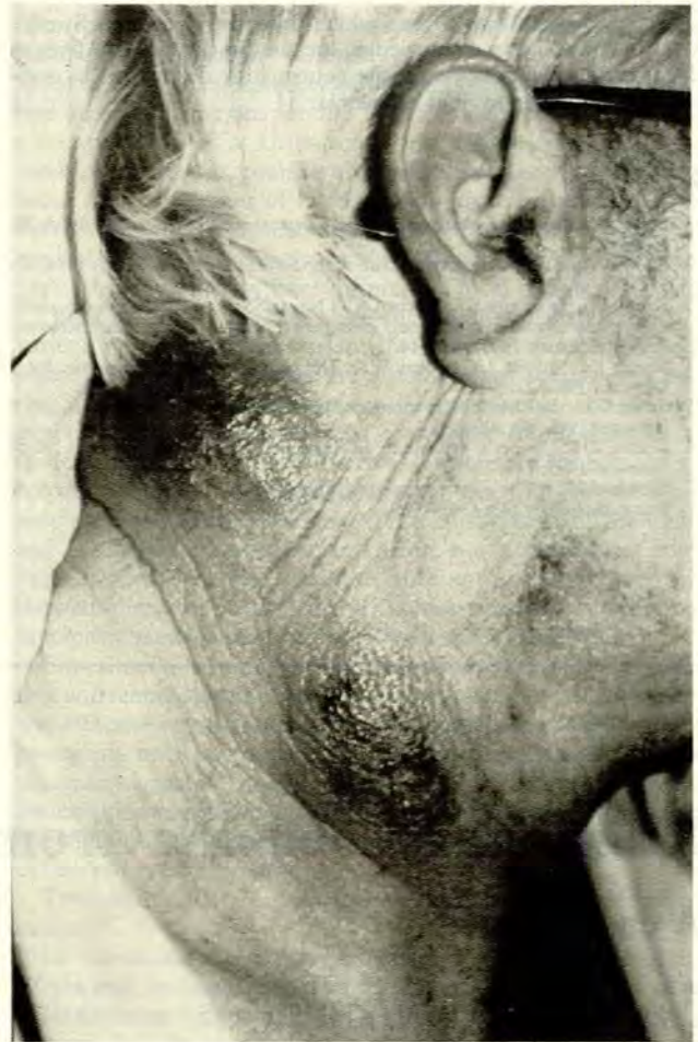
Fig. 3. Case 2 — two reddish purple tumours on the side of the neck.

The majority of cases of Sweet's syndrome described thus far have involved women aged between 30 years and 60 years. However, cases involving children 3 and men 4 have been reported. Although in most cases the aetiology was idiopathic, the associations with Sweet's syndrome have included, among others, bronchiectasis, 5 lupus erythematosus, 6 rheumatoid arthritis, 7 sub-acute thyroiditis, 8 Dressler's syndrome, 9 and Behçet's disease. 10 However, the most important association with Sweet's syndrome is undoubtedly the presence of underlying malignant disease. In this context it must be noted that of all the cases of Sweet's syndrome described to date, 10-12% were associated with malignant disease. 11 These authors