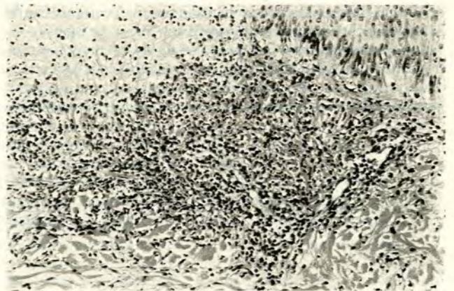
Fig. 2. Case 1 — histological section of a skin lesion showing spongiosis, sub-epidermal oedema and a nodular infiltrate of lymphocytes, mature neutrophils and nuclear dust.

Special investigations: A full blood count showed haemoglobin 11,9 g/dl, white cell count 13 \times 10^9/l with 85% neutrophils, and erythrocyte sedimentation rate (ESR) 120 mm/1st h (Westergen). Urinalysis revealed haematuria, proteinuria, hyaline and granular casts. The following tests were either normal or negative: ECG, chest radiography, blood culture, protein electrophoresis, serology for viral and rickettsial infections, and collagen vascular disorder investigations which were negative for antinuclear and rheumatoid factors. Examination of biopsy specimens of the skin lesions revealed typical neutrophilic infiltrates without evidence of vasculitis; these were indicative of Sweet's syndrome (Fig. 2).