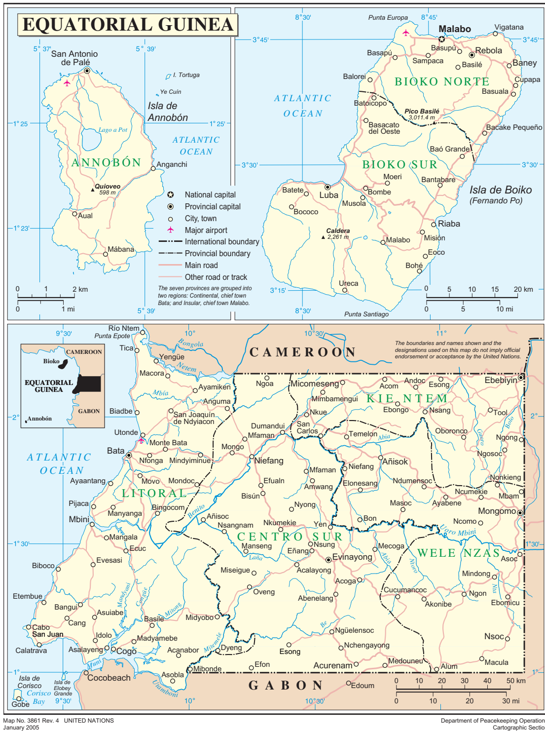
Map 1: Map of Equatorial Guinea (UN 2005).

Guinea-Bissau.” Roberts (2006:18) describes its location as in “the armpit of Africa, a small patch of land divided between a square of mainland territory and a scattering of islands in the Gulf of Guinea” (see Map 1 ).