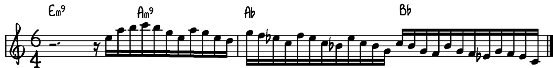
Figure 2: “Meditation Suite”, example of the McCoy Tyner influence in Mseleku’s improvisation, in his use of pentatonic scales. Transcription by the author.

Mseleku plays around with more subtle nuances of South African musical styles when the main theme returns. When he recapitulates the vocal chant at 04:39 to 04:59, the melodic phrase leans more towards “maskandi”, a Zulu folk music popularized by Phuzushukela in the ’60s. Mseleku soon changes to a different melodic rhythm that suggests the rhythms of the Bapedi people of the Northern Sotho by implying a double time feel (05:00-05:18). These musical influences are also used by pianist Moses Molelekwa, for instance in the song “Rapela” on his record Genes and Spirits (2000). At 05:44 Mseleku reintroduces the original theme with a call and response between the voice and the piano.