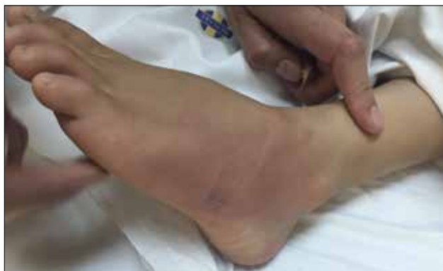
Fig. 1. The left foot, red and slightly swollen.

A cranial computed tomography scan of the brain was normal. Standard routine laboratory blood tests (Table 1) as well as