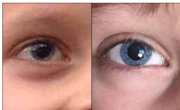
Fig. 2. The pupils 3 weeks after the incident (left) compared with the pupils 6 months after the incident (right).

Fig. 2 compares the pupils 3 weeks after the incident with the pupils 6 months after the incident. The dilated pupils were still present 6 months after the incident, and the ophthalmologist prescribed pilocarpine. The senses of taste and smell could not be assessed in this patient during hospitalisation. Loss of sense of taste and smell are usually prominent features of berg adder bite. [1,7,9] However, when specifically asked, the parents reported that after the incident the boy had said on numerous occasions that his favourite food 'did not taste right'. About a month after the incident,