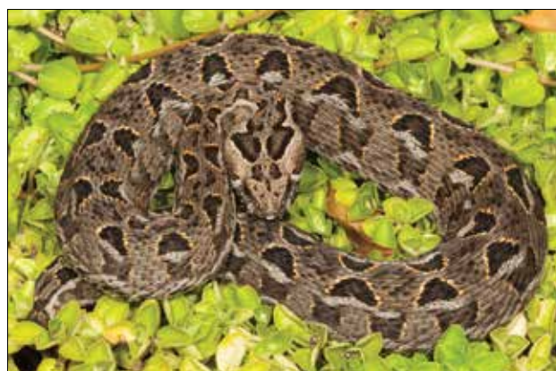
Fig. 4. Berg adder ( Bitis atropos ) from the Western Cape.

The berg adder is known to be aggressive, and will strike without undue provocation. Its preferred habitat is montane grassland up to a level of 3 000 m, as well as coastal fynbos. [2,8] Berg adder envenomation causes a unique syndrome of cytotoxic and neurotoxic symptoms and signs. [1,2] Local effects include initial pain in the region of the bite mark and swelling. [4,6,7] Systemic effects include paraesthesiae of the tongue and lips, ophthalmoplegia characterised by visual disturbances, ptosis, fixed dilated pupils and loss of eye movements and accommodation, as well as loss of the sense of smell (anosmia) and taste. The dilated pupils and loss of the sense of smell and taste may take weeks to months to resolve. Late-onset respiratory failure is a complication 6 - 36 hours after the bite, often at a stage when it is not anticipated or expected. [1,4-7] Hyponatraemia, which may lead to convulsions, often develops 2 - 3 days after the bite and should not be interpreted as a syndrome of inappropriate antidiuretic hormone secretion (SIADH). [11] Hyponatraemia is probably the result of a natriuretic peptide in the venom that induces renal