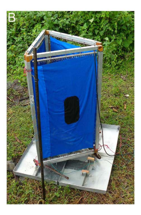
Figure 2. The experimental design used to investigate G. f. fuscipes circling or landing on an object. 3-D object with (A) and without (B) flanking net. doi:10.1371/journal.pntd.0001257.g002