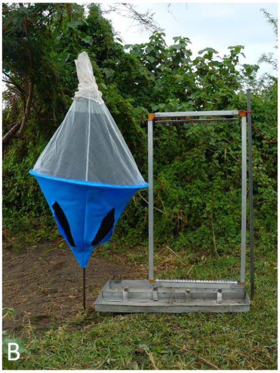
Figure 1. This shows the standard control devices against which new designs were compared. Each is flanked by an electric net to catch flies which circle the device but do not land. Electrified black target with flanking net (A) and a biconical trap with flanking net (B). doi:10.1371/journal.pntd.0001257.g001

[14,17] and this type of tiny target is being considered for control purposes.