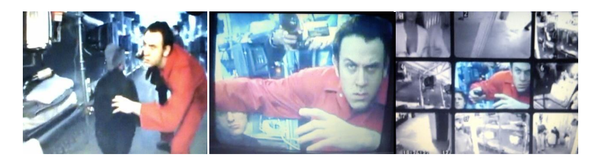
Figures 5, 6 and 7 Mutual gazing by self and others in "Quiet".

The "Quiet" and "We Live in Public" experiments both function on various levels of looking: selves are clearly observed by others but are also looked at by the self through the eyes of the self as other. To demonstrate this, Timoner adequately juxtaposes several images which serve in better understanding the complexities of looking while being filmed in these environments (see figures 5, 6 and 7).