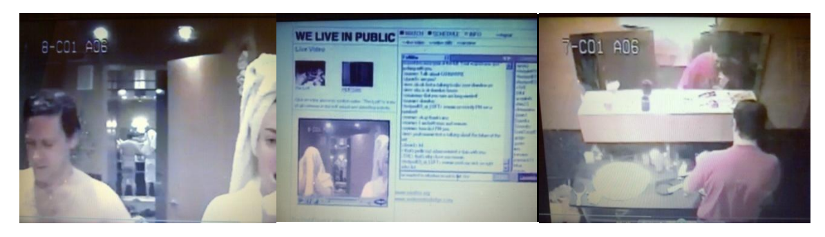
Figure 9, 10 and 11

Timoner selects interesting compositions as a means to highlight the self-reflexive form this film often adopts and inspire an intellectual engagement with the content seen. It is a convention of contemporary mainstream documentaries to often make use of the "sit-down" interview that is usually "carefully composed" and "well lit" (Maasdorp 2011:217). Timoner makes use of this convention throughout the film and uses it as an opportunity to comment on the notion of self-reflexivity.