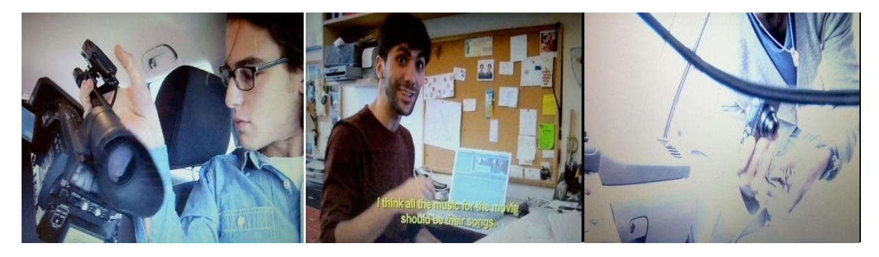
Figures 1, 2 and 3

with a second camera. In the next shot, the filmmakers cut to a close-up of their subject on the telephone, from Schulman's point of view, obviously taken with the handheld camera seen in the previous shot.