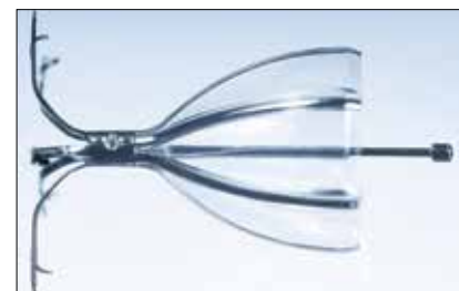
Fig. 2. An intrabronchial (IBV) valve.

ware. [3] Additionally, valves fail to induce collapse when the affected portion of the lung has collateral ventilation. This is a normal physiological phenomenon in many individuals, but significant interlobar collateral ventilation subverts the deflating effect of endobronchial blocking devices.