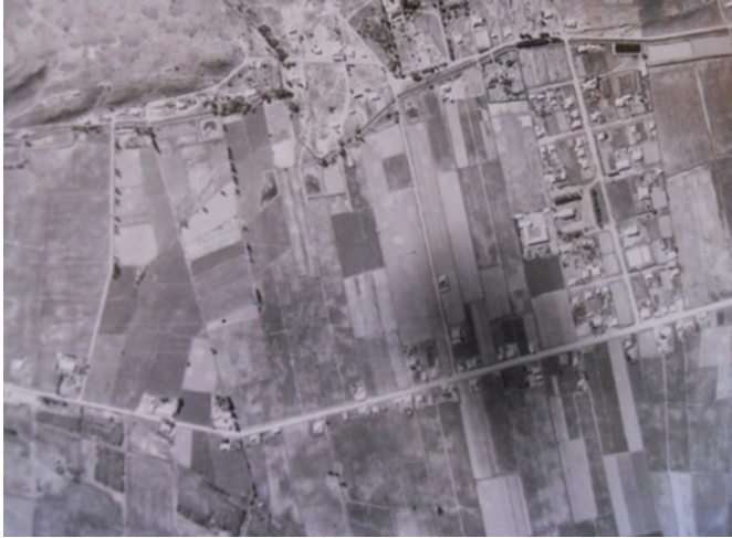
Image 4: An aerial view of the typical, long, rectangular-shaped irrigation lots at Bonnievale. The town lies between the road and the canal towards to top end of the photo