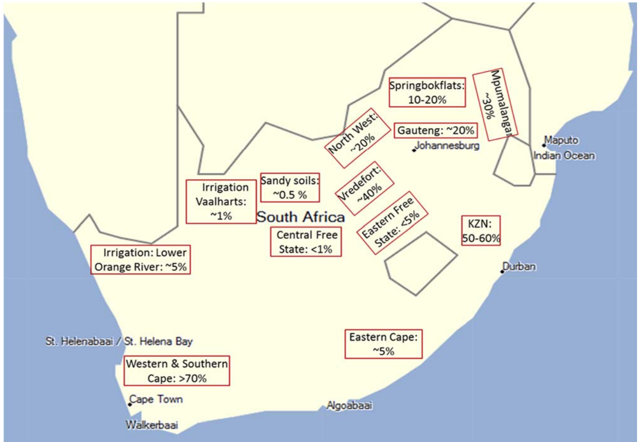
Figure Error! No text of specified style in document..1 Current status of Conservation Agriculture adoption in South Africa

likely to be successful if the system is tailored to the local conditions (Wall, 2007). Figure 3.1 gives an illustration of the current status of conservation agriculture adoption in South Africa.