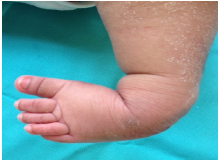
Figure 1. Example of a clubfoot with ankle equinus, hindfoot varus, forefoot adduction and supination

Congenital talipes equinus varus, or clubfoot, which was first described by Hippocrates in 400 BC, is still the most common orthopaedic congenital anomaly. 1-4 This deformity is characterized by ankle equinus, hindfoot varus, forefoot adduction and supination. 5 2,6-8 (Figure 1)