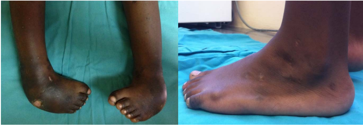
Figure 3: Pre-operative picture of bilateral residual clubfeet