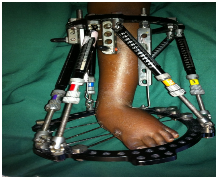
Figure 2: The Taylor Spatial Frame as applied for clubfeet

This enables the Taylor Spatial Frame to correct deformities in three planes namely coronal, sagittal and axial plane. Angular, translational, rotational and length deformities can also be corrected simultaneously.