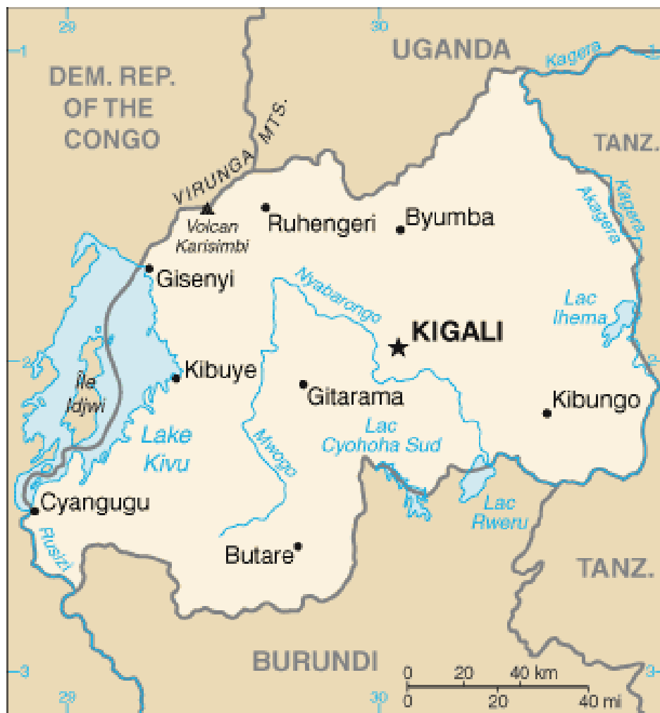
Map of Rwanda before 1994