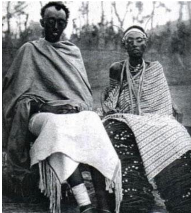
Queen Kanjogera and her son king Yuhi Musinga.