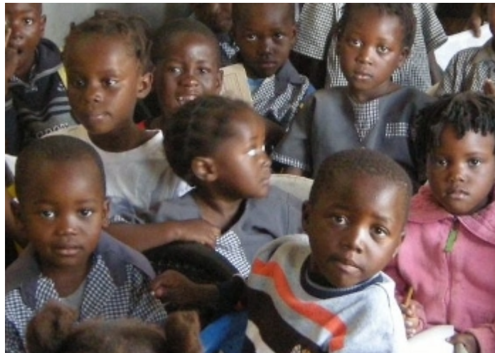
Figure 7: Showing school children in a community school class

The value of education cannot be overlooked because it is vital for the social and economic development of any country. Therefore, it makes sad reading that many children in George Compound cannot afford education either due to losing parents in death and no other family member is capable to support them, or because parents or relatives are incapacitated. The other impeding factors are the exorbitant school fees schools charge which their parents cannot afford, and then the issue of distance to the available schools. These factors make children face few prospects once they reach adulthood.