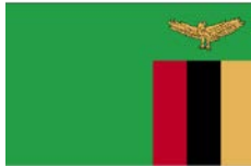
Fig. 1: The Flag of Zambia.

The country enjoys a tropical climate which is modified by altitude and has three seasons: rainy season which runs from November to March; winter season from April to July; and the hot season are from August to October. “Zambia’s climate”: < http://goafrica.about.com/od/zambia/a/zambiafacts.htm > (accessed July, 15, 2008).