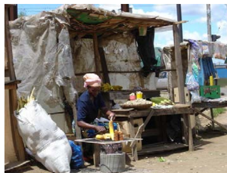
Figure 10: Showing a poor little girl and a lady conducting business in a make-shift stall