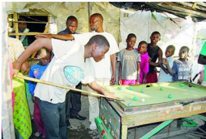
Figure 6: Youths playing Pool

Life in George Compound may look confusing to a new person or an outsider. But this is not the case to the local dwellers, because they are simply trying to make a living. Take for instance, the everyday life of local vendors who the locals call “Ngwang’wazi” because of the nature of their business. These vendors are dedicated long distance walkers because the nature of their business takes them all over George Compound and other surrounding areas selling merchandise. Therefore, when walking the streets of George Compound one has to be careful or else he/she might bump into these vendors who carry every kind of merchandise on their heads, hands and backs.