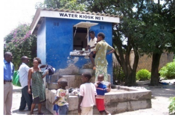
Figure 8: Showing people drawing water at a Water Kiosk

Family life is difficult because people have big families which they cannot support. According to Mrs. Rebecca Mbaulu a LWSC worker based at Lilanda branch, poverty has impacted the social – economic life of people in George compound in many ways such as lack of easy access to clean water, food, high rentals, poor road network, lack security and employment. Clean water is not a cheap commodity for people in George compound to get.