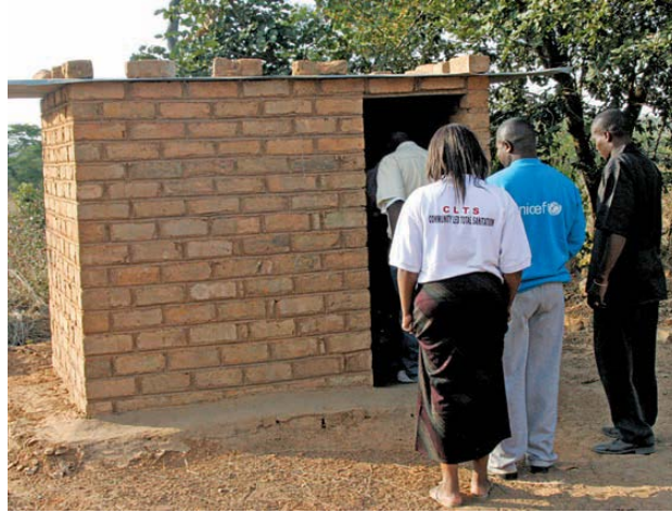
Figure 9: Inspecting a VIP toilet

Besides the failure to meet water demand, the LWSC is also facing the challenge of collecting solid waste. This is attributed to the increasing population, incapacity for people to pay user fees, and the poor road network in George Compound. The other factor is the limited financial capacity and human resource the local authority is experiencing.