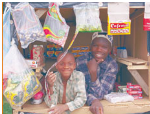
Figure 11: Showing houses, a road and boys selling in a make shift stall (Kantemba)

However, poverty remains a significant problem in Zambia despite claims of improving economy that cannot be translated into reality of life on the ground.