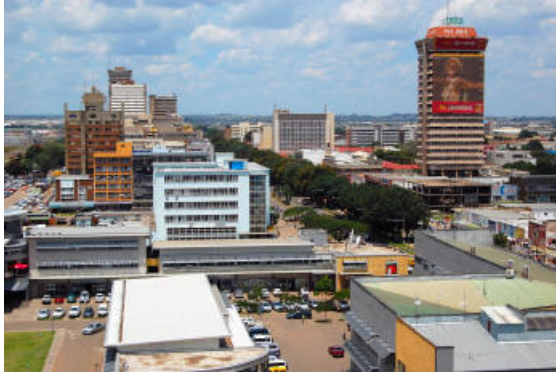
Figure 4: Showing part of City of Lusaka