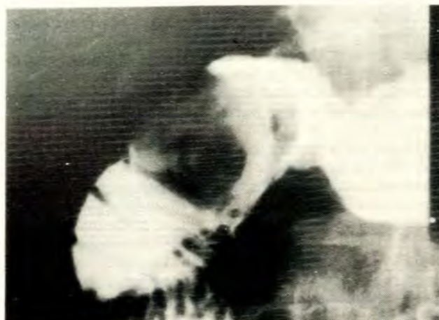
Fig. 1. Barium meal study showing the duodenal tumour.

Islet cell tumours of the pancreas usually draw attention to themselves because of the hormones they secrete. A minority have no clear-cut hormonal symptoms (somatostatinoma, pancreatic polypeptide-secreting APUDoma) or are hormonally inactive, and these present with symptoms related to mass or infiltration of adjacent structures. Gastro-intestinal haemorrhage is an unusual presentation.