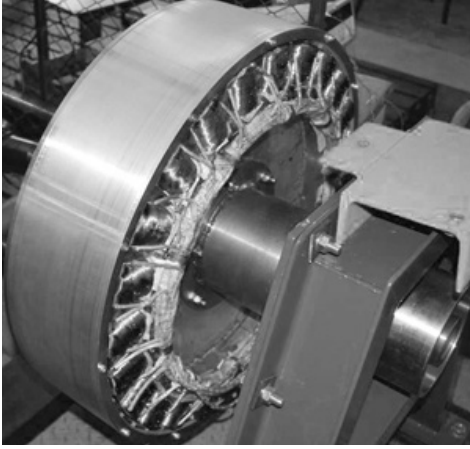
Fig. 2: The machine used for testing is seen here on a test bench.

data that is listed in Table II. The exact method for measuring the magnet and yoke loss is outlined in the Appendix.