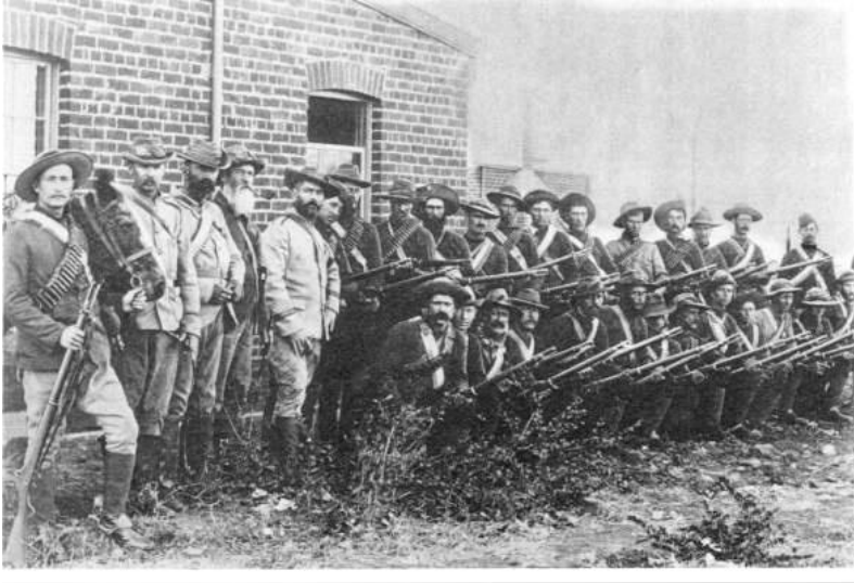
The Afrikaner Corps.