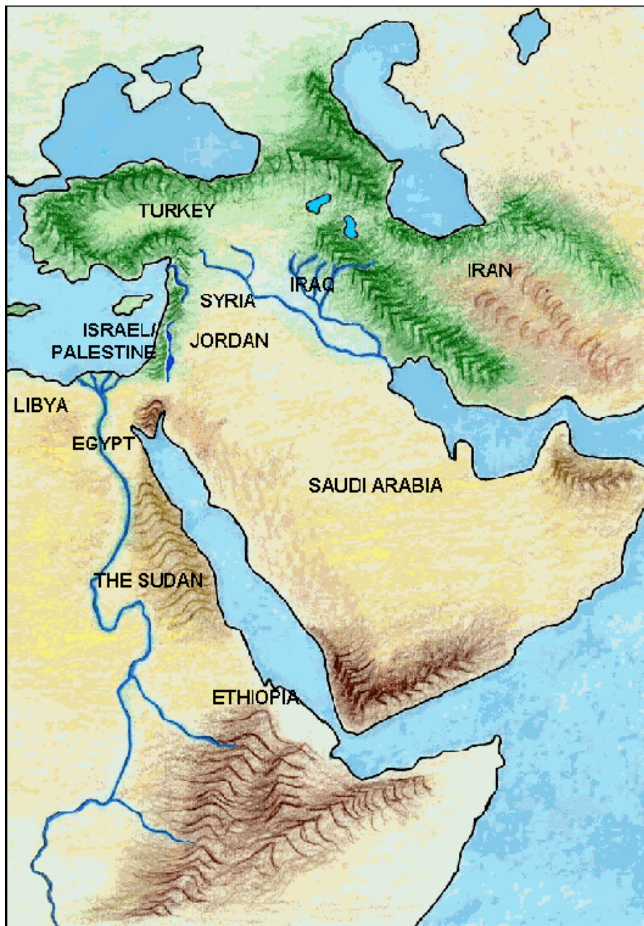
Figure 3: The Geographical Location of the Ancient Near East Today (Van der Merwe 2010:BH 178 No 1 ANE.ppt).