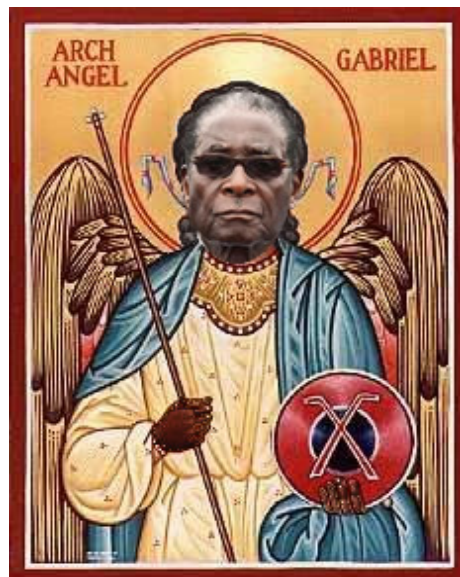
Figure 4: President R.G. Mugabe Illustrated as Angel Gabriel

political Moses. He is also quoted as having described the president as a God-given leader who cannot be driven out of office even by election (Mugabe God Given-Church Leaders 2011).