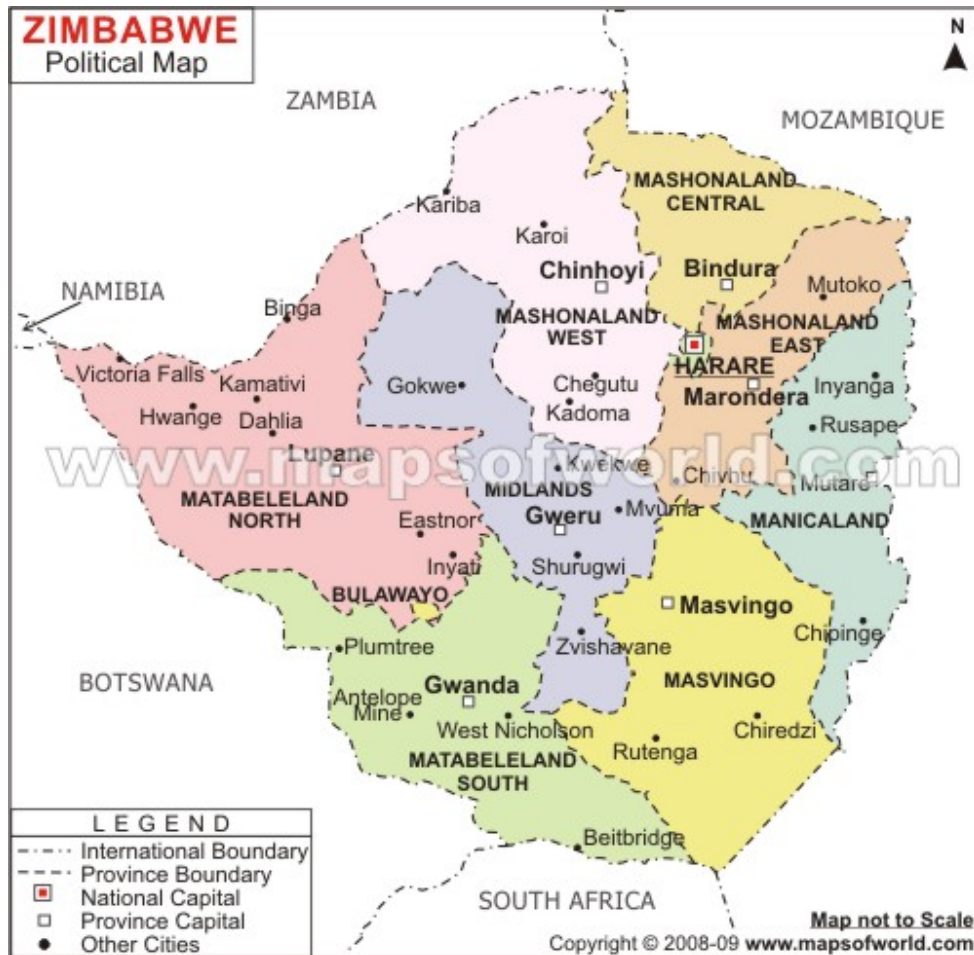
Figure 1: Political Map of Zimbabwe

http://www.mapsofworld.com/zimbabwe/zimbabwe-political-map.html Retrieved 06 24, 2011