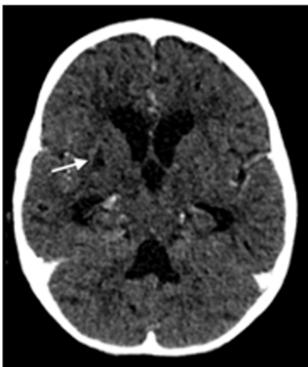
Figure 2 Axial contrasted CT showing infarction involving the right internal capsule extending to the lentiform nucleus (see arrow).

kg, pyrazinamide 40 mg/kg and ethionamide 20 mg/kg, as well as prednisone (2 mg/kg). Aspirin 3 mg/kg/day was prescribed in lieu of the extensive CSVT. Shortly after admission, raised intracranial pressure necessitated insertion of ventriculoperitoneal shunt. Within 72 hours following admission, the child's respiratory status worsened that necessitated high dose dexamethasone (oral prednisone stopped), intravenous antibiotics and high flow nasal oxygen. During the recovery phase, she received speech, occupational and physiotherapy.