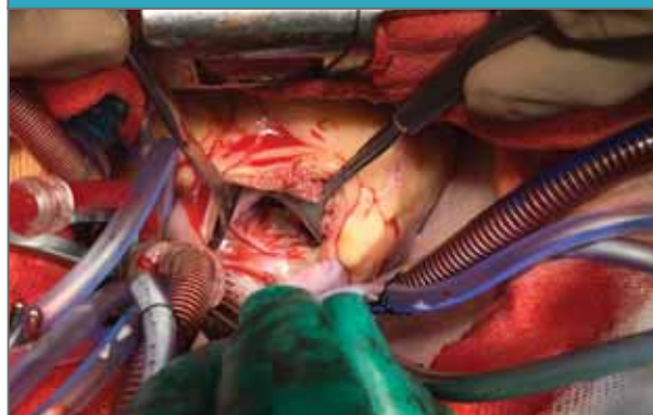
VIDEO 4: Intra-operatively, via right atriotomy, the anatomy of the interatrial septum is delineated. The surgeon first points to the tricuspid valve followed by the large CS-ASD, and finally the intact secundum septum.

At surgery the CS in our patient was confirmed to be completely unroofed with an associated coronary sinus ASD (Video 4). In the setting of a PLSVC with completely unroofed CS, a CS associated-ASD is present in the postero-inferior region of the interatrial septum in the usual position of the coronary sinus ostium. (2) Whilst this posteriorly positioned defect in the interatrial septum could not be visualised on TTE, it was evident on both TOE and CMR. Surgical correction included ligation of the PLSVC, which entered the LA superiorly, and patching of the CS-ASD with a pericardial patch. The unroofed portion of the CS within the LA was not baffled, leaving a clinically non-significant intracardiac right-to-left shunt at atrial level.