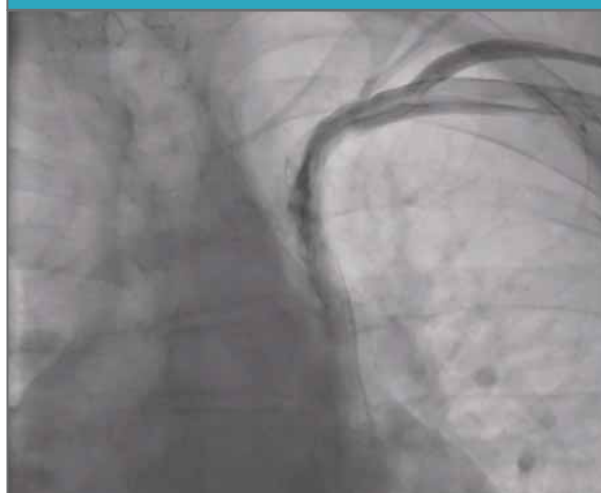
VIDEO 3: Fluoroscopic image during iodinated contrast injection via the left cubital vein. The PLSVC is delineated and seen to enter the roof of the LA. A flash of contrast towards the right SVC raises the suspicion of a bridging vein.