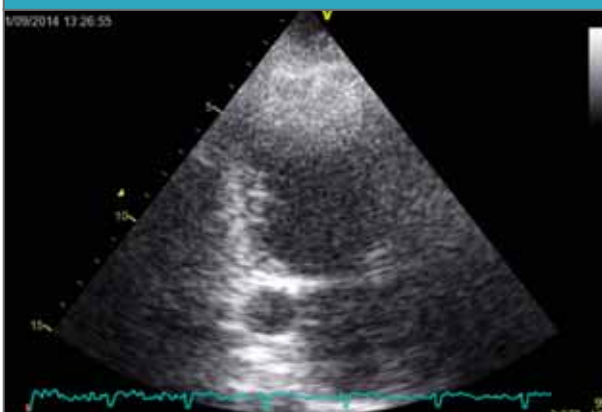
VIDEO 1: Apical 2-chamber TTE view during agitated saline contrast injection via the left cubital vein. Contrast is seen to enter the CS first followed by direct spillage into the LA, confirming the CS to be unroofed.