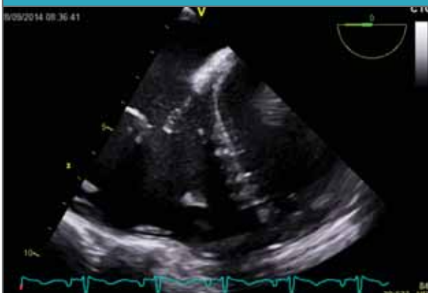
VIDEO 2: Low oesophageal 4-chamber TOE view at the level of the CS during agitated saline contrast injection from the left cubital vein. A defect is apparent in the postero-inferior portion of the interatrial septum and the roof of the CS is absent. Saline contrast enters the LA superiorly via the PLSVC and then shunts into the RA across the CS-ASD. Note the dilated right ventricle.