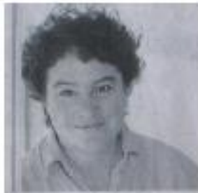
Die digter en skrywer Marlene van Niekerk.

"Hoekom nie erken dat dit ten minste 'n morele, estetiese en akademiese moontlikheid is en dat ons dit skuld aan die land waar Nederlands gespraak is en met plaaslike en buitelandse in-