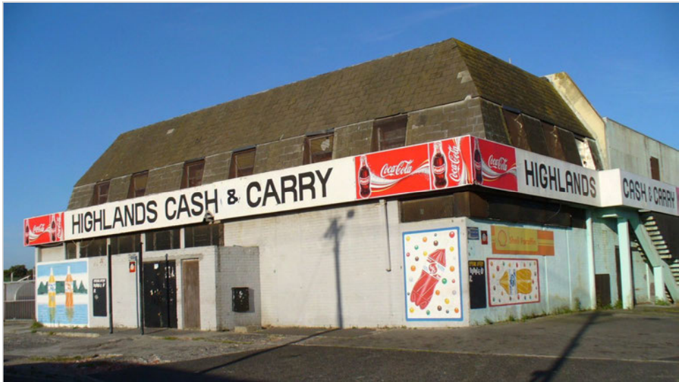
Club Montreal today

GC: You were well known through your live gigs, but this album put you on the map?