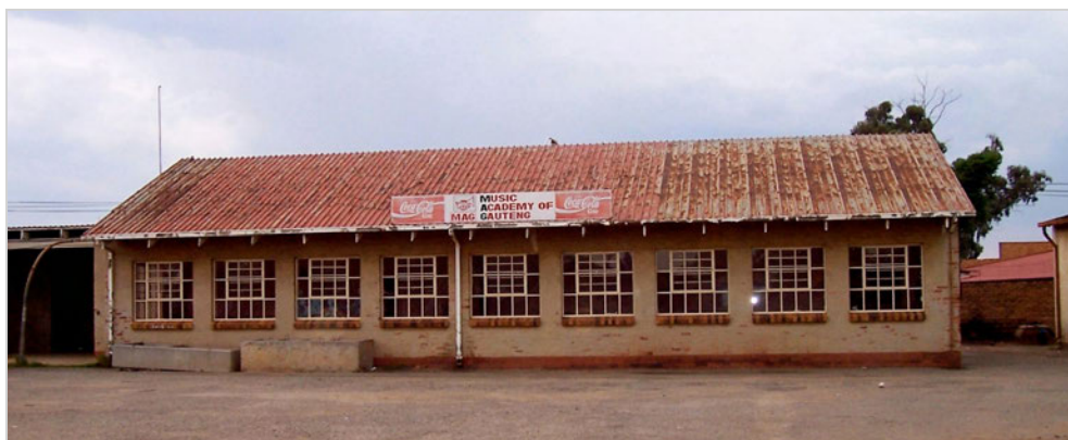
Johnny's Music Academy of Gauteng (initial site)

in Switzerland, they've got holiday homes in Paris, in Spain and all over, and yet some of those poor musicians died, and their children, their families, their grandchildren are living in poverty.