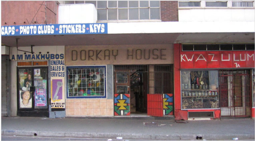
Dorkay House today