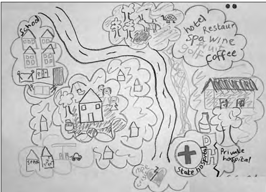
Figure 9.1: Community map by US student (CSI2008)

It is difficult to describe the charged emotional atmosphere that became a part of this learning environment. Students and staff alike became absorbed in each other’s narratives and insights into what it was like to live, learn and love in South Africa today. The diversities, richness and disparities of experiences were immediately evident from the community map and river of life drawings produced by students at the start of each module. Figure 9.1, drawn by a student from US, depicted a fairly pleasant looking community, with trees, animals and evidence of good economic resources. The other community map is by a student from UWC (Figure 9.2) and depicts the different social problems faced by that community. This student stresses the importance of hope in bringing about change.