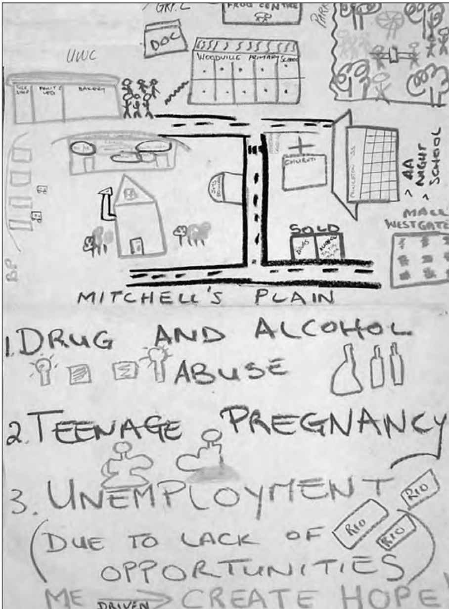
Figure 9.2: Community map by student from UWC (CSI2008)

We have selected these drawings because they illustrate fairly stereotypical differences. It is important to state that not all UWC students had difficult lives and not all US students had easier ones. For example, many students from both institutions had similar concerns about crime and safety, and students from both institutions had experienced loss in their lives. But what