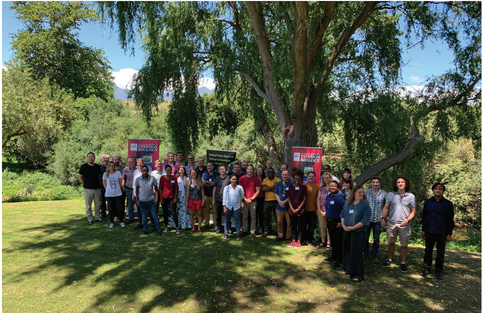
Figure 3. Workshop attendees benefitting from the shade of an alien Eucalyptus sp. on a transformed lawn.