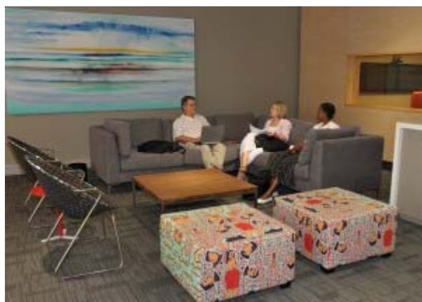
Part of the lounge at the Research Commons

and, of which the Stellenbosch University Library and Information Service is a member.