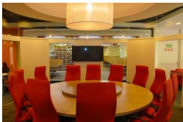
One of the seminar rooms at the Research Commons