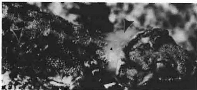
Figure 1 Freshly wounded Pachydactylus namaquensis from the Richtersveld National Park showing the extensive (but not exceptional) integumentary damage (arrows). The exposed areas remain covered by a thin portion of the lower dermis.

Pachydactylus namaquensis and P. bibronii were collected in rocky habitat at Anysberg Nature Reserve, Cape Province, South Africa (33°44'S / 20°27'E) on 19 October 1991. These specimens have been deposited in the collection