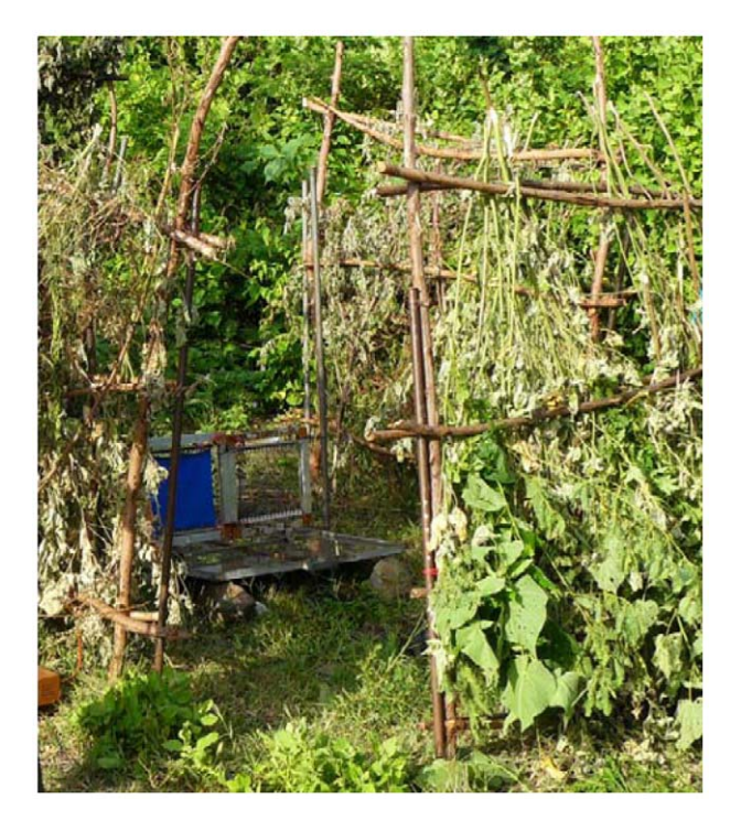
Figure 2. A small target closely surrounded by 15 cm hedges to investigate the effect of thick grass regrowth. doi:10.1371/journal.pntd.0001336.g002

(9.9 flies/day, s.e.d. = 0.08) caught 80% (P<0.001) more females than the target with one drum in front (Treatment A, 2.0 flies/ day) and 98% more females than with a drum on each side (Treatment B, 0.03 flies/day). Catches of male G. f. fuscipes showed no significant difference (P = 0.2) between the target in the open and either of the treatments, although 20% less flies were caught with one drum in front of the target (Treatment A, 3.2 flies/day) and 80% less with a drum on each side of the target (Treatment B, 0.2 flies/day), completely obscuring the frontal views. When placing a target next a real tree trunk (Table 1, exp. 9) there was a doubling in female catches with both the blue cloth closest to