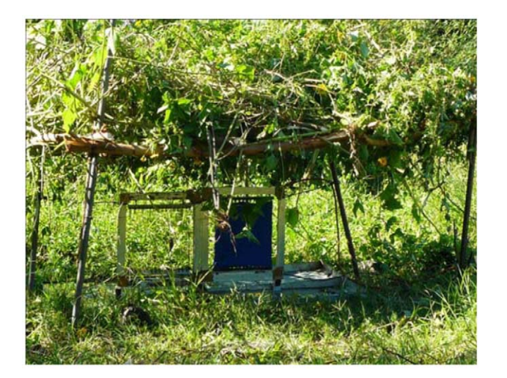
Figure 3. A small target underneath a 0.5 m high leafy canopy to investigate the effect of overhanging vegetation. doi:10.1371/journal.pntd.0001336.g003

Vegetation encroachment around a small target, from the sides and above, does not significantly affect its killing efficiency for G.f. fuscipes as long as there are some openings between adjacent bushes, wider than 30 cm. These results are intriguing because the rapid re-growth potential of the tropical vegetation in the habitat of G. f. fuscipes and other Palpalis group tsetse, combined with the small size of the targets, could make it seem improbable that these targets will remain effective. Indeed, our results show that only one such scenario, grass regrowth very close to the target, poses a serious threat to their performance. Our simulation of grass height corresponds roughly to between c. 15 (15 cm high) and 60 days (60 cm high) as observed in the rainy season in the field. As expected, the small diameter clearings (0.75 m) created by the