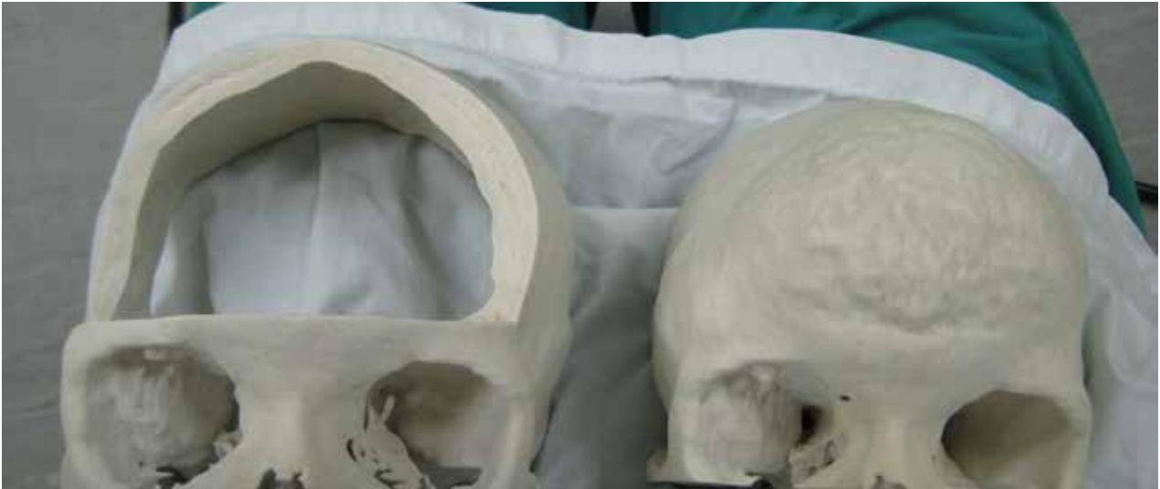
Figure 4: Pre-surgical planning of an intraosseous meningioma. A planned craniotomy is done on the 3D model.