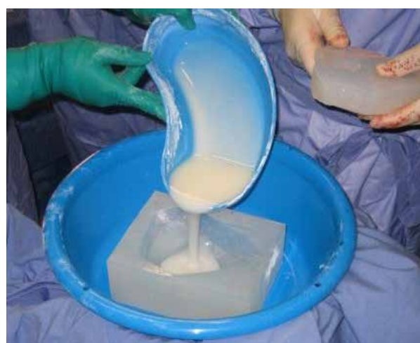
Figure 2: PMMA is mixed and placed in the mould.