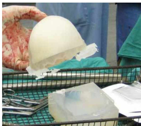
Figure 3: A custom implant. Excess PMMA is easily trimmed.

the defect is appreciated. PMMA is mixed and placed in the mould. After it has set and cooled, minor trimming of the graft is done and secured in place with cranial fixators and/or miniplates. Prophylactic antibiotics are given routinely prior