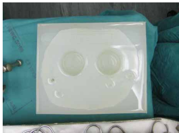
Figure 1: A two piece custom silicon mould that can be autoclaved.

The silicon mould is autoclaved just prior to the procedure and presented to the surgeon once the defect is exposed. Dural edges are freed until the full thickness of the skull surrounding