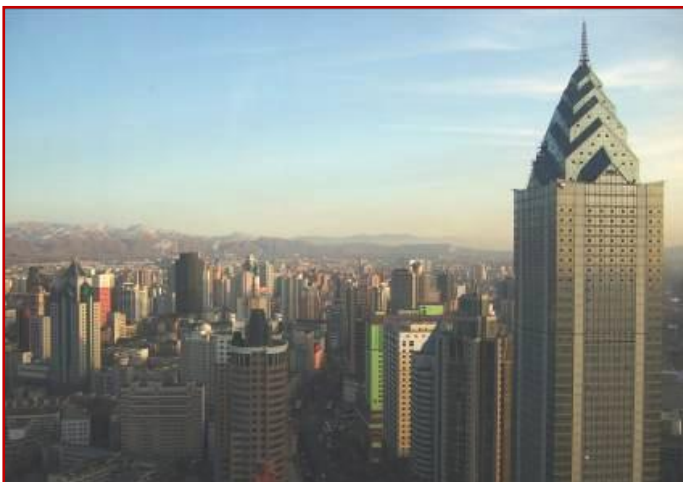
Figure 9. Looking south over Urumqi in 2008, the city's new tallest building, the Zhongtian Guangchang in the foreground