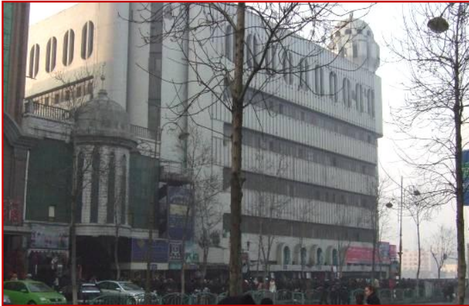
Figure 7. Rebiya Kadeer Building