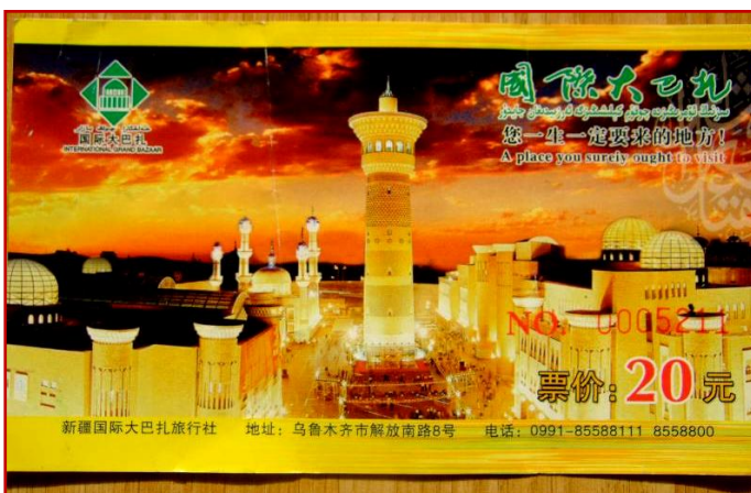
Figure 3. Souvenir ticket from viewpoint at the top of the Bazaar's central tower