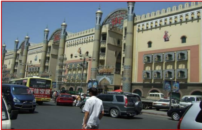
Figure 1. Minorities Bazaar in Shanxi Hang