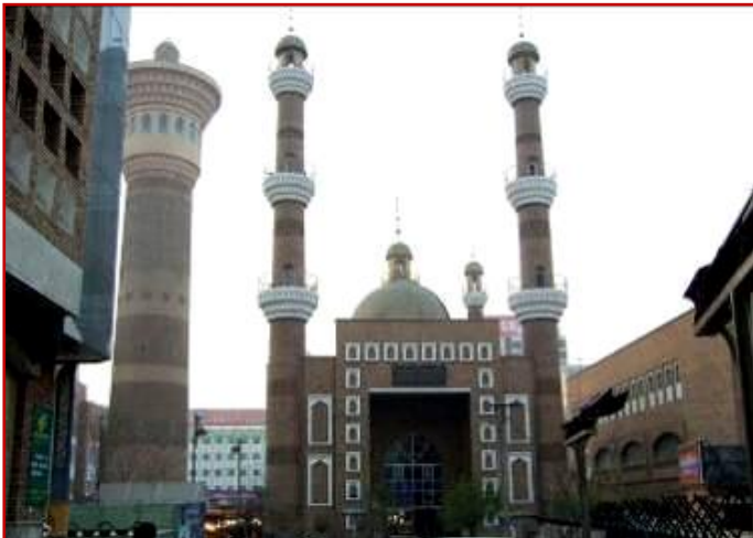
Figure 8. Mosque, International Grand Bazaar