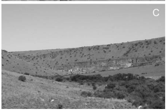
Fig. 2. Examples of indigenous riparian vegetation in three broad climatic areas of South Africa: A, closed-scrub fynbos vegetation in the winter to all-year rainfall area (Elands River); B, woodland riparian vegetation in esummer rainfall area (Sabie River); C, Acacia karroo riparian vegetation in the arid interior (near Three Sisters).