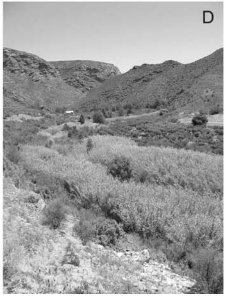
Fig. 3. Examples of alien plant invasions in riparian zones in South Africa: A, dense invasion by Acacia mearnsii along a foothill section of the Riviersonderend River in the winter to all-year rainfall area; B, Salix babylonica invasion along the Vaal River in the summer rainfall area; C, dense Prosopis species invasion along a watercourse in the arid interior; D, dense invasion by the alien reed Arundo donax along the Huis River in the arid interior.