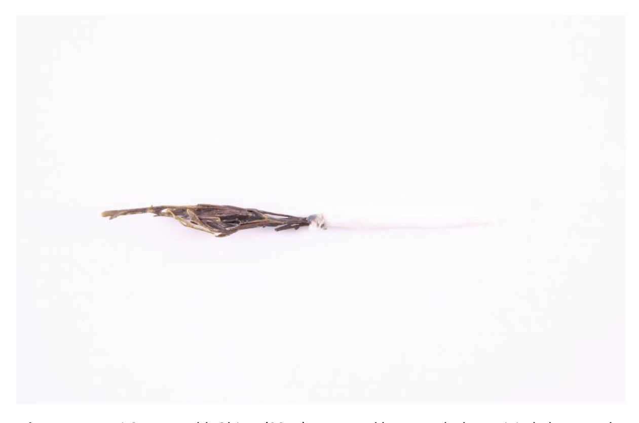
Figure 15. Joani Groenewald, Object (2014). Brass and lamp work glass. Digital photograph.