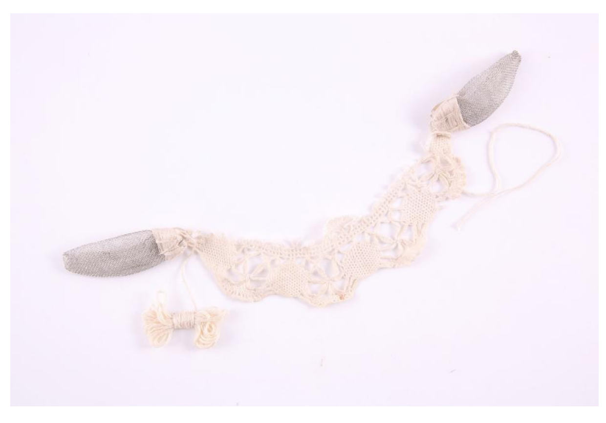
Figure 11. Joani Groenewald, Borslappie #1 (2013). Brooch/neckpiece: Lace, thread, silver, tea strainers. Digital photograph.