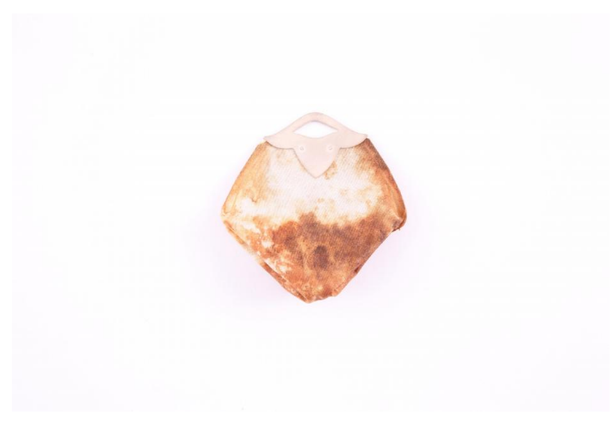
Figure 9. Joani Groenewald, Teesakkie #1 (2013). Brooch: Antique napkin, silver, rooibos tea. Digital photograph.