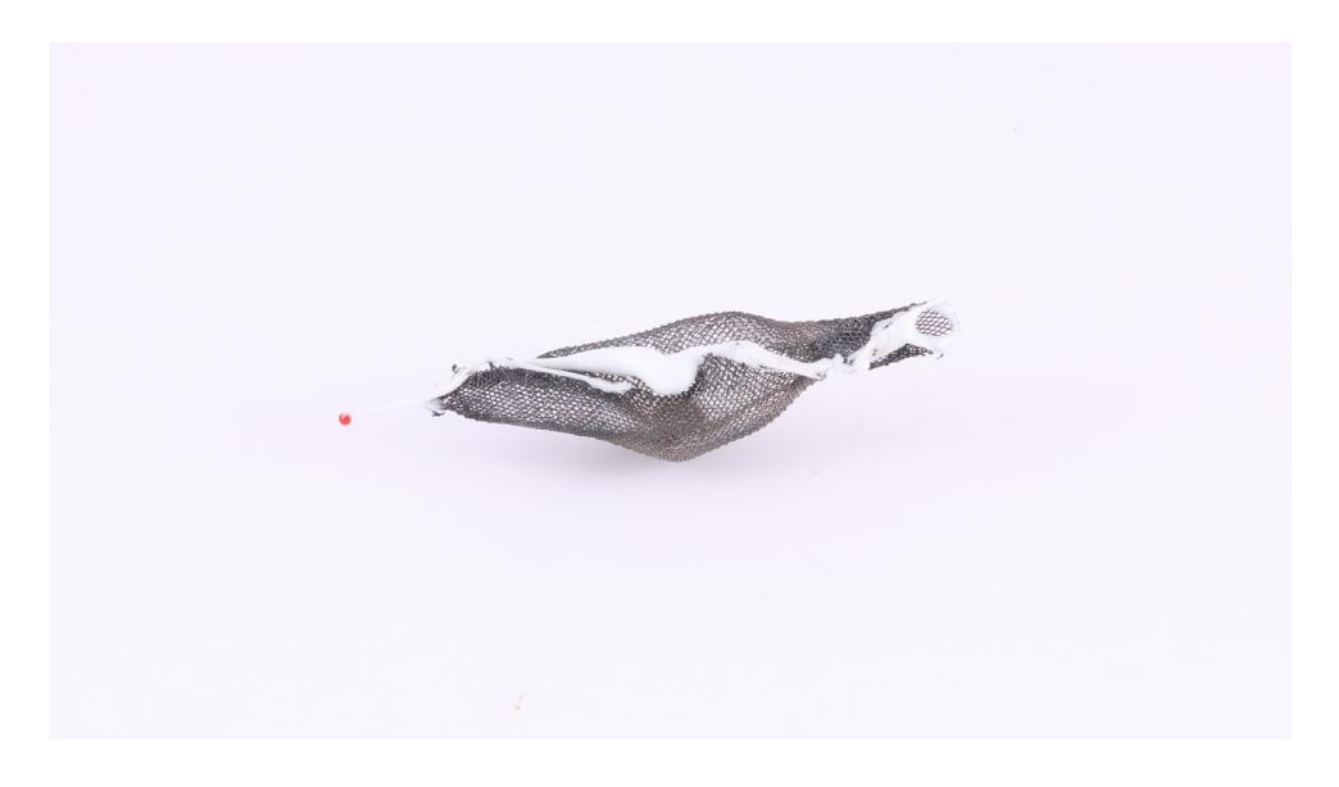
Figure 21. Joani Groenewald. Object (2014). Lamp work glass and steel mesh. Digital photograph.