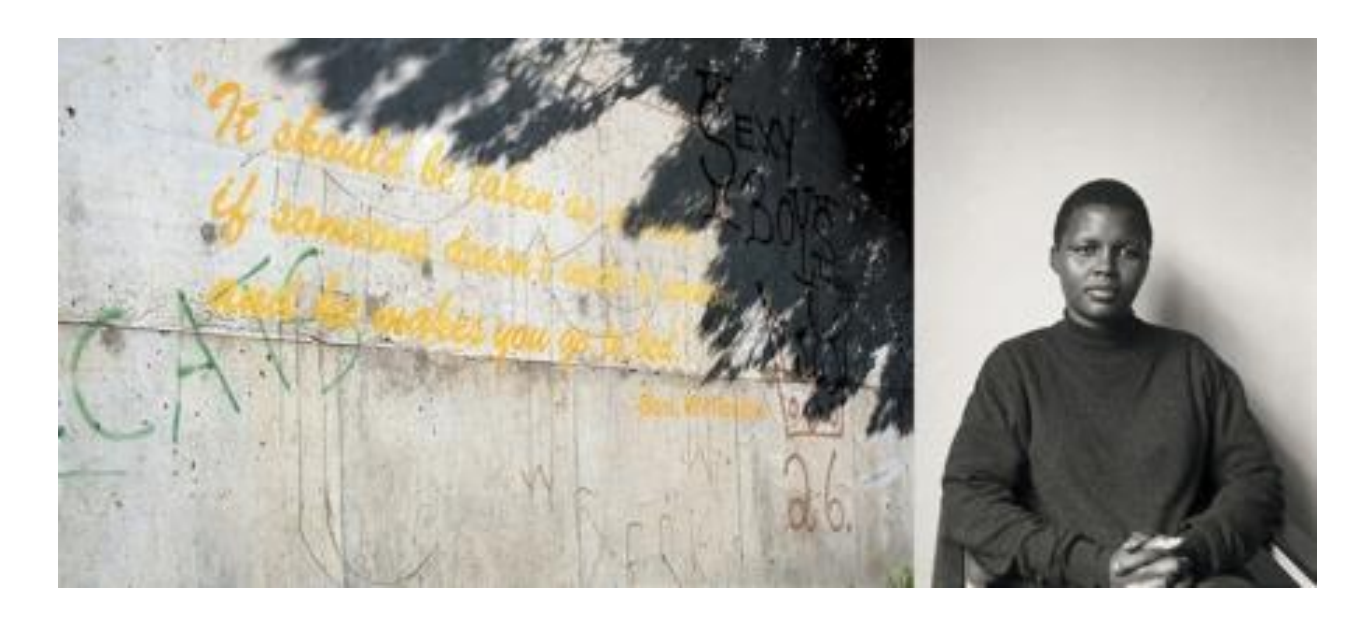
Figure 26 . Sue Williamson. From the inside - Busi (2000). Dibond print 90 x 200 cm. (Goodman Gallery [Online]).