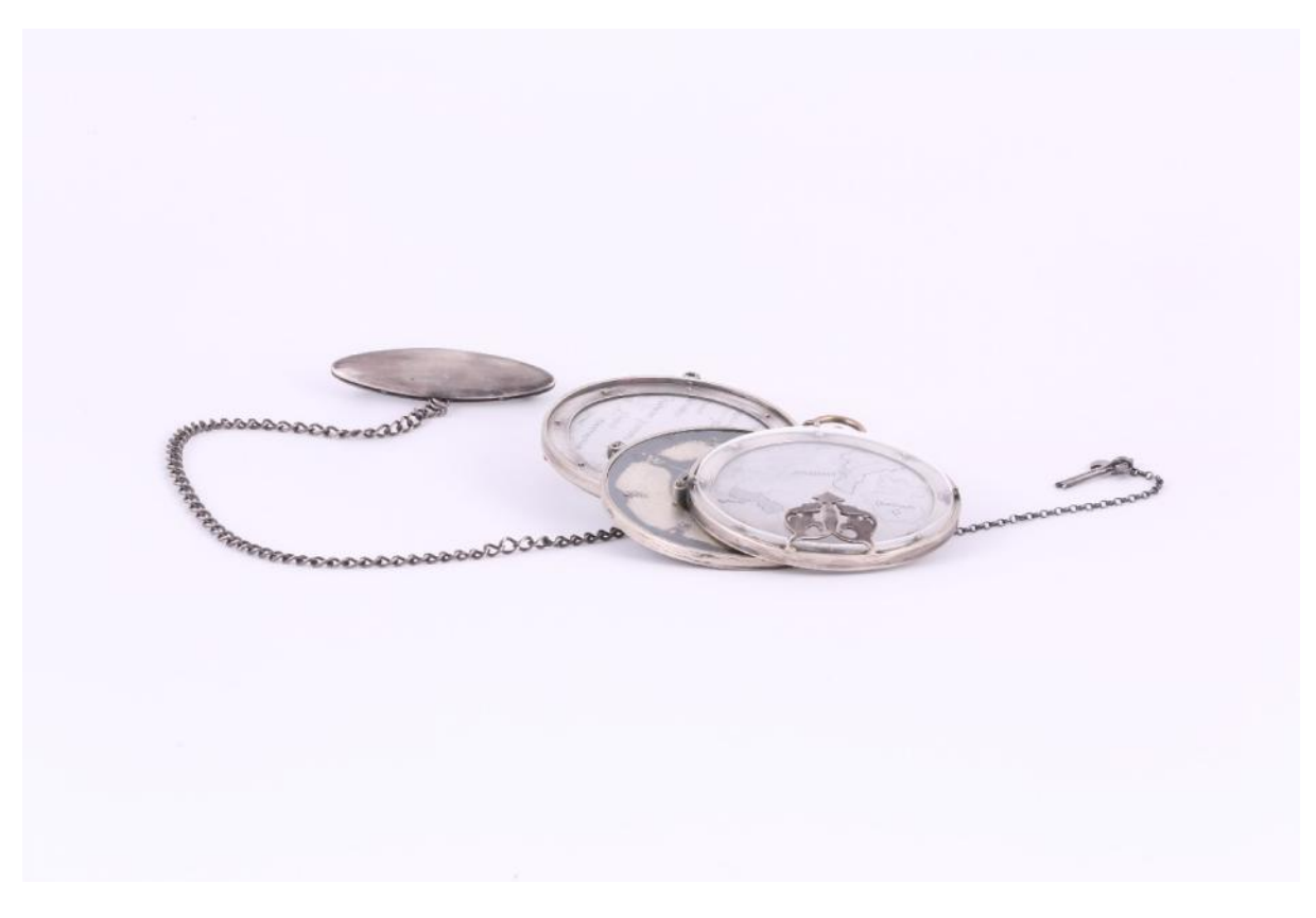
Figure 3. Joani Groenewald, Brooch (2012). Silver, 9ct rose gold, paper and plastic. Digital photograph.