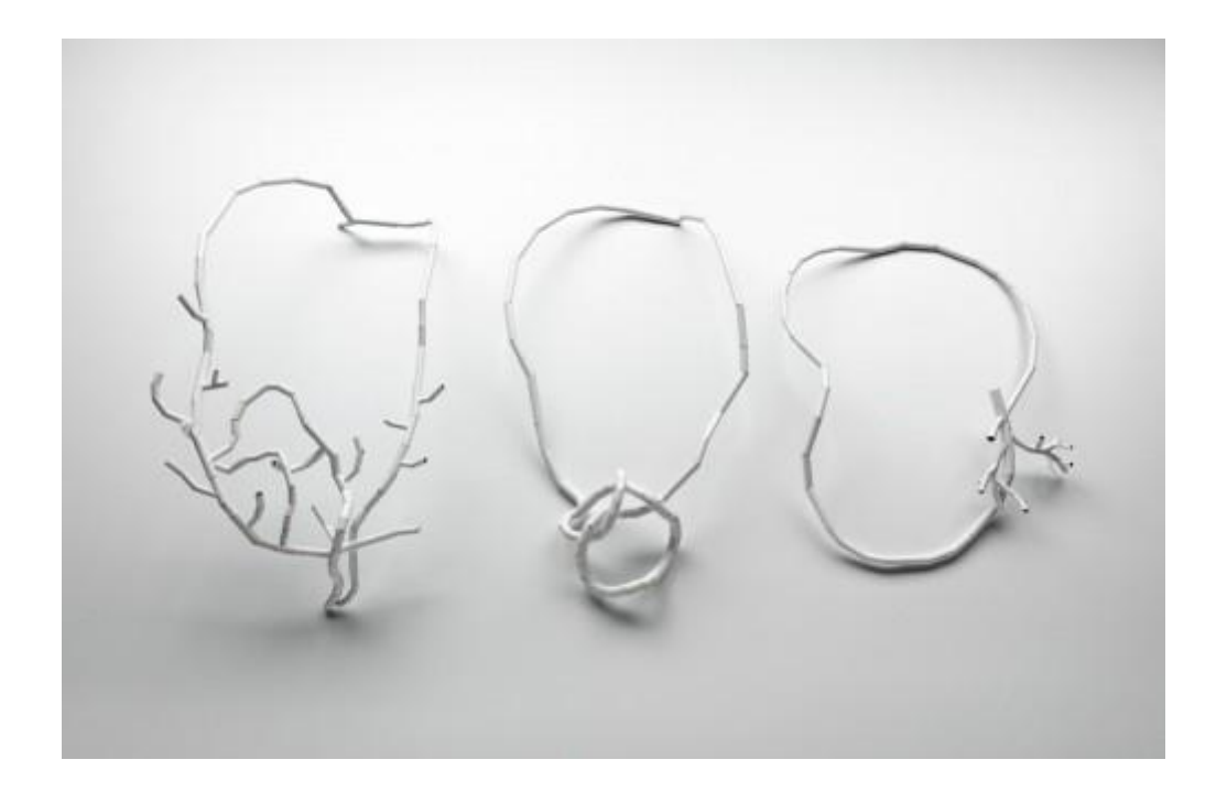
Figure 35. Xylem (2013) Neckpieces: Powder coated brass and copper chenier vary. (Jess Dare [Online]).