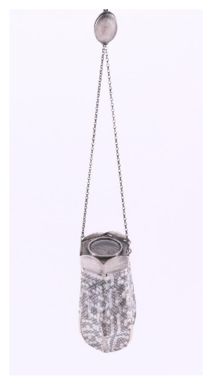
Figure 2. Joani Groenewald, Brooch (2014). Silver, paper and plastic. Digital photograph.