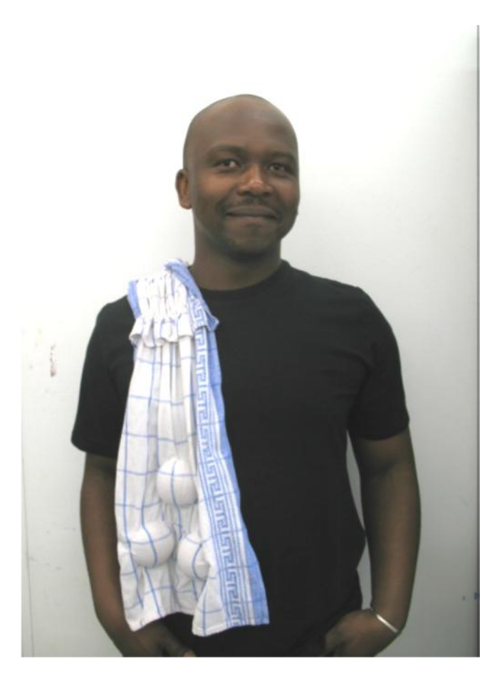
Figure 28. Nini van der Merwe, Blue and white #1 (2011). Neckpiece: Cotton, silk thread, upholstery foam, wood. (Van der Merwe 2013).