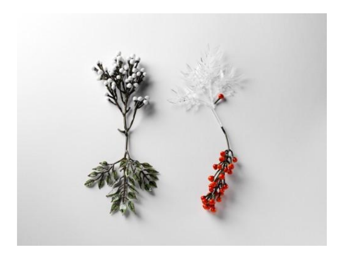
Figure 31: Jess Dare. Conceptual flowering plant series (2013). Object: Lampwork Glass. (Jess Dare [Online]).