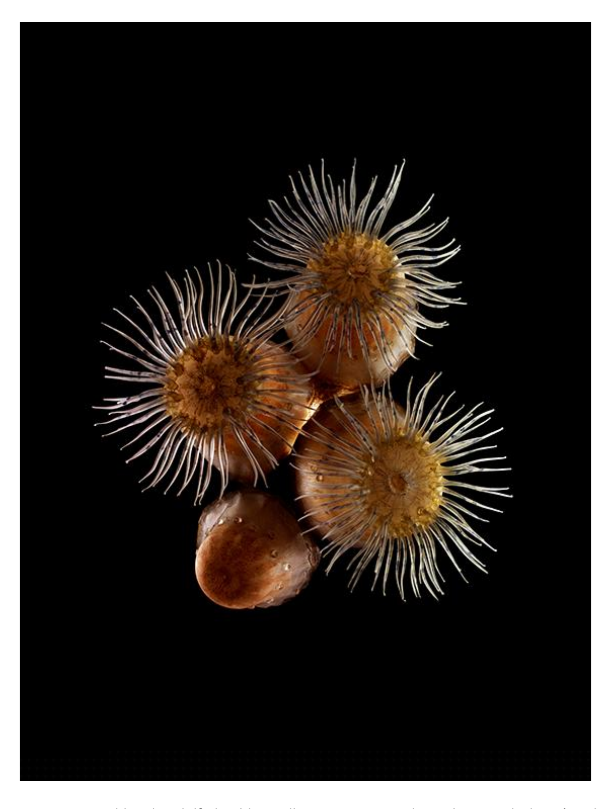
Figure 34 . Leopold and Rudolf Blaschka. Calliactis Decorata . Object: lampwork glass..