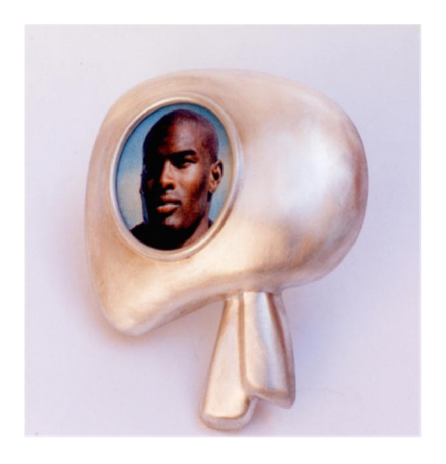
Figure 25 . Carine Terreblanche, Die Kappie (1999). Brooch: Silver, photographic image. (Burger 2013).