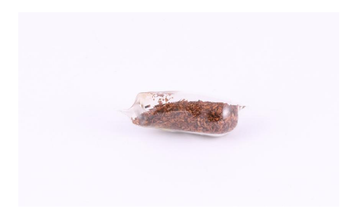
Figure 19. Joani Groenewald. Rooibos #2 (2014). Glass Rooibos tea. Digital photograph.