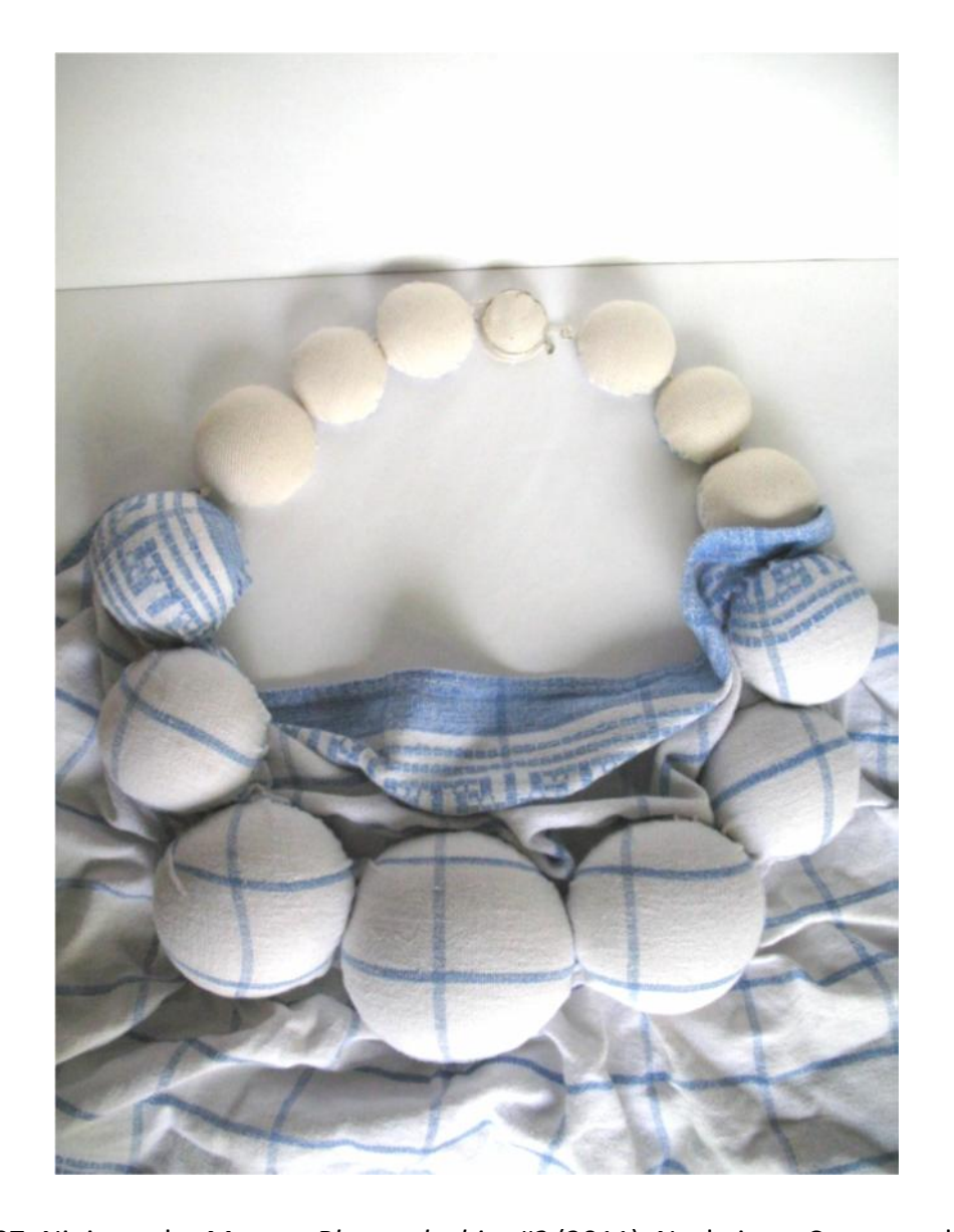
Figure 27. Nini van der Merwe, Blue and white #2 (2011). Neckpiece: Cotton, upholstery foam, wood, sterling silver, silk thread. (Van der Merwe 2013).