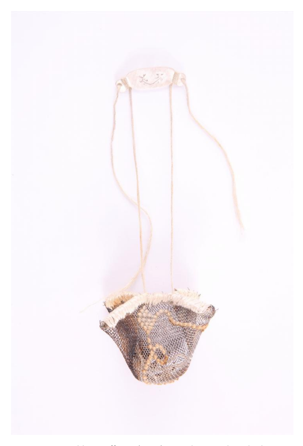
Figure 6. Joani Groenewald, Teesiffie #3 (2013). Brooch: Lace, thread, silver, tea strainer, rooibos tea. Digital photograph.