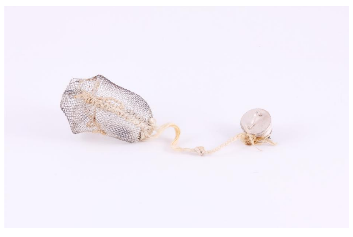
Figure 5. Joani Groenewald, Teesiffie #2 (2013). Brooch: Lace, thread, silver, tea strainer, rooibos tea. Digital photograph.