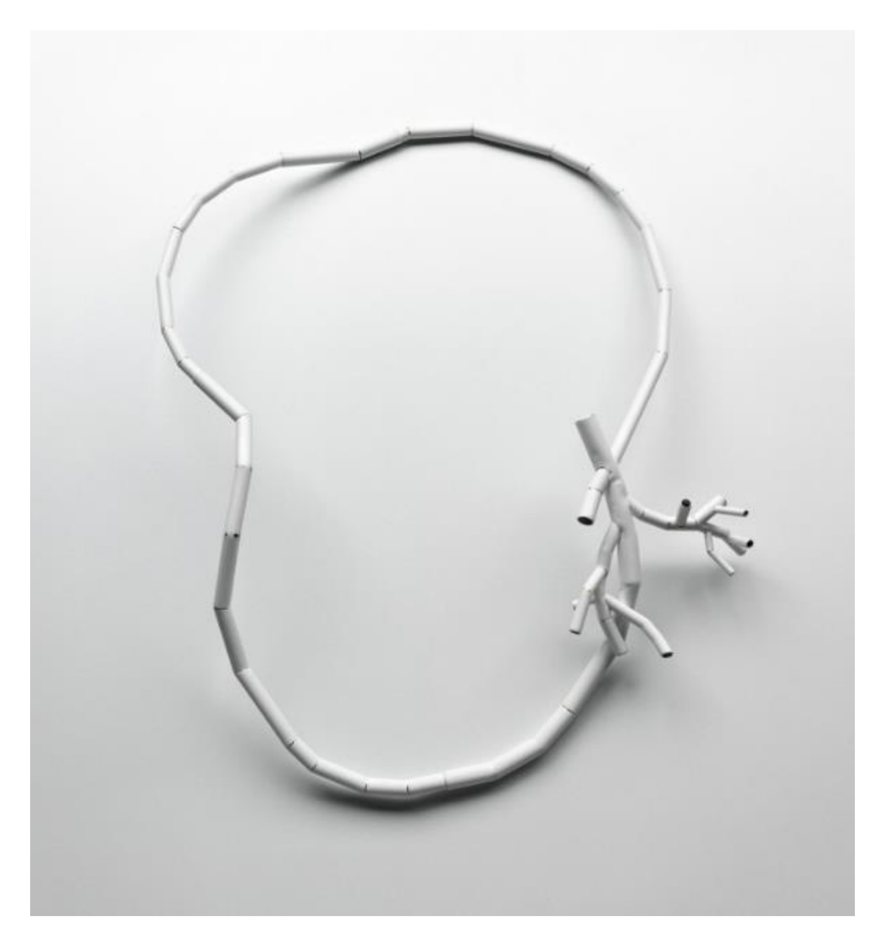
Figure 36. Xylem (2013) Neckpiece: Powder coated brass and copper chenier vary. (Jess Dare [Online]).