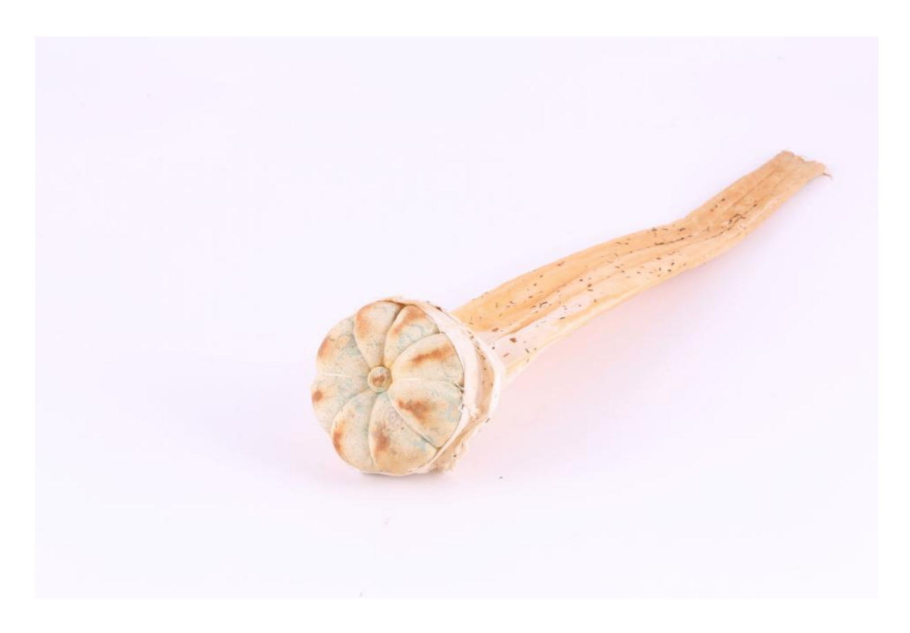
Figure 23. Joani Groenewald, Object (2014). Linen and rooibos tea. Digital photograph.