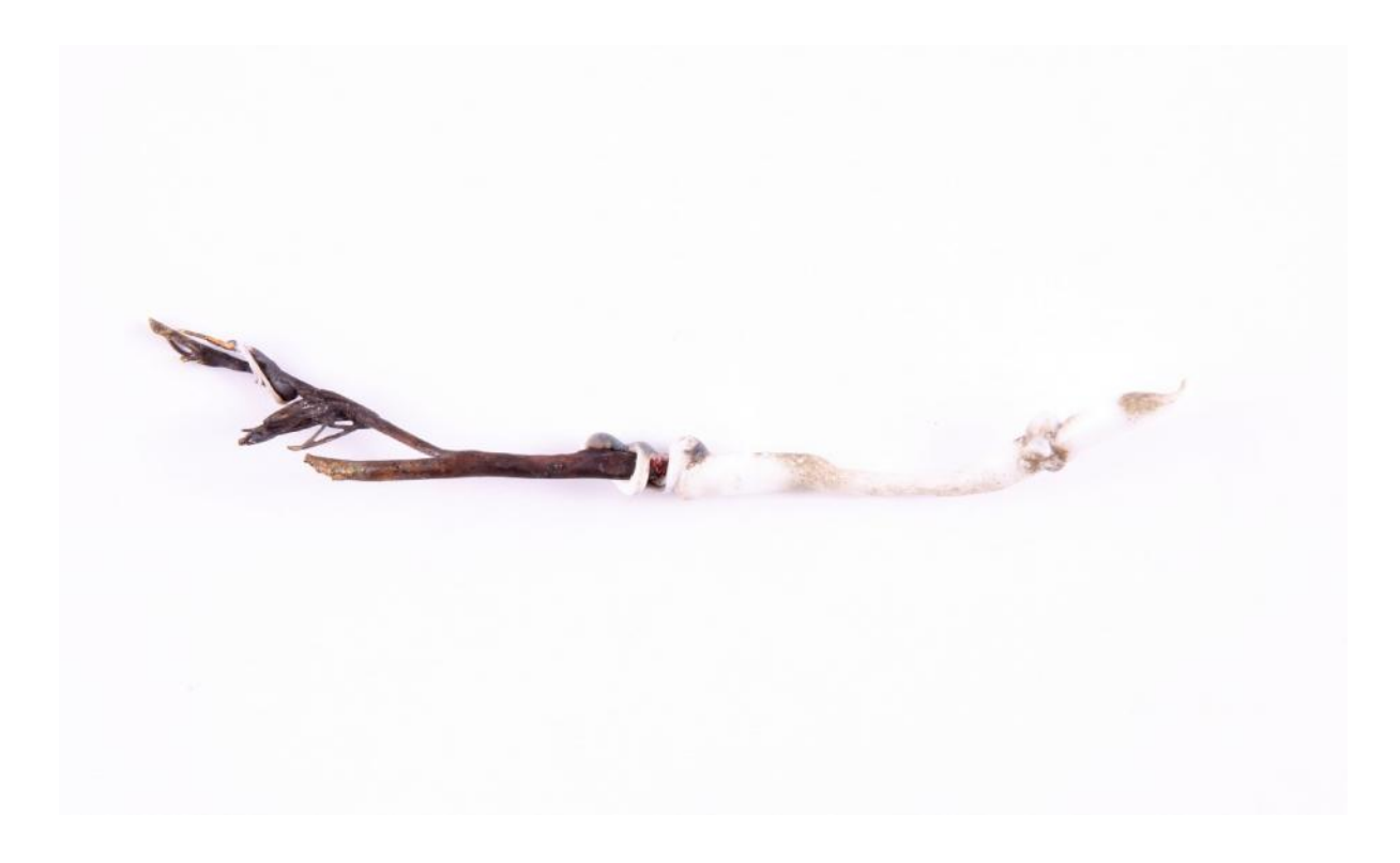
Figure 16. Joani Groenewald, Object (2014). Brass and lamp work glass. Digital photograph.