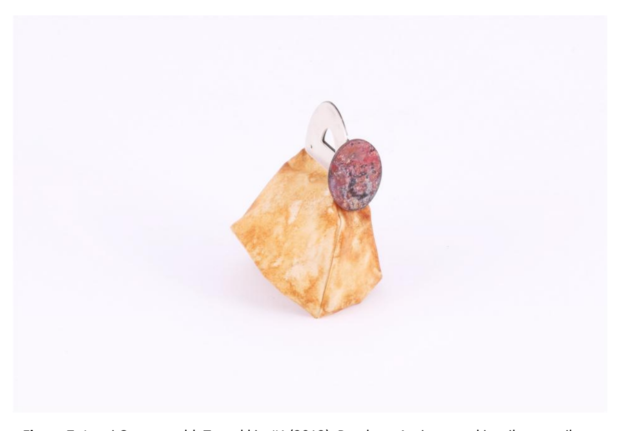
Figure 7. Joani Groenewald, Teesakkie #1 (2013). Pendant: Antique napkin, silver, rooibos tea. Digital photograph.