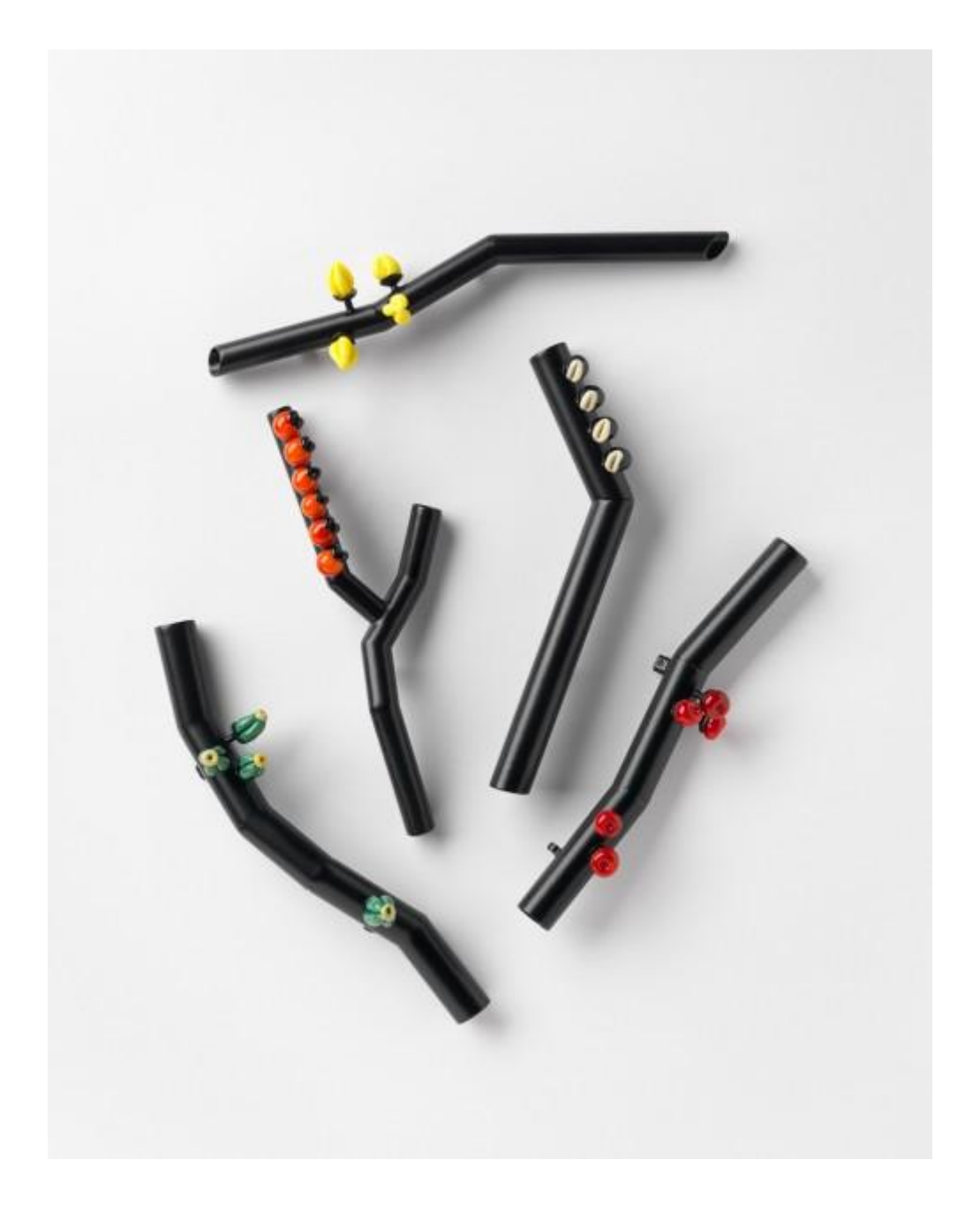
Figure 38. Jess Dare. Epicormic series (2013). Brooches: Powder coated brass and copper, sterling silver, lampwork glass, stainless steel vary. Photography by Grant Hancock. (Jess Dare [Online]).