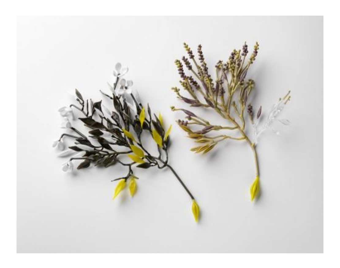
Figure 32: Jess Dare. Conceptual flowering plant series (2013). Object: Lampwork Glass. Photography by Grant Hancock. (Jess Dare [Online]).