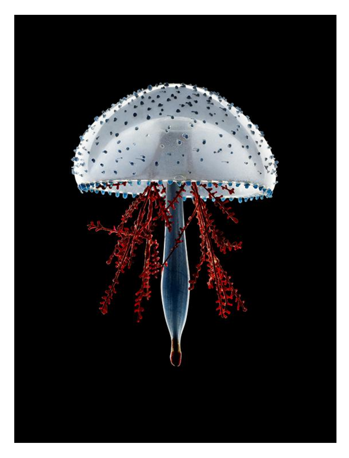
Figure 33 . Leopold and Rudolf Blaschka. Lymonorea Trieda . Object: lampwork glass. (Guido Mocafico [Online]).