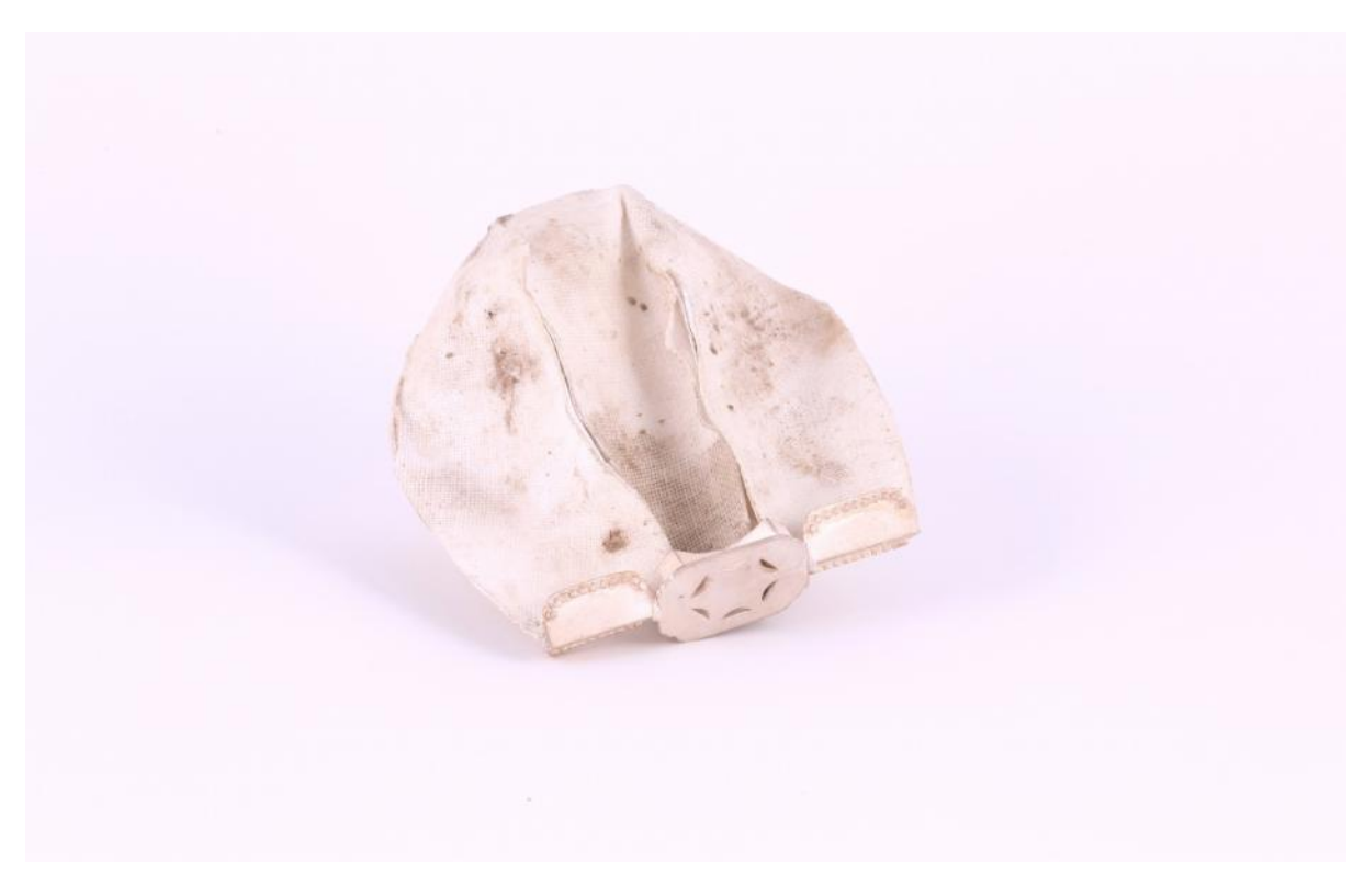
Figure 13. Joani Groenewald, Object (2013). Linen, paper and silver. Digital photograph.