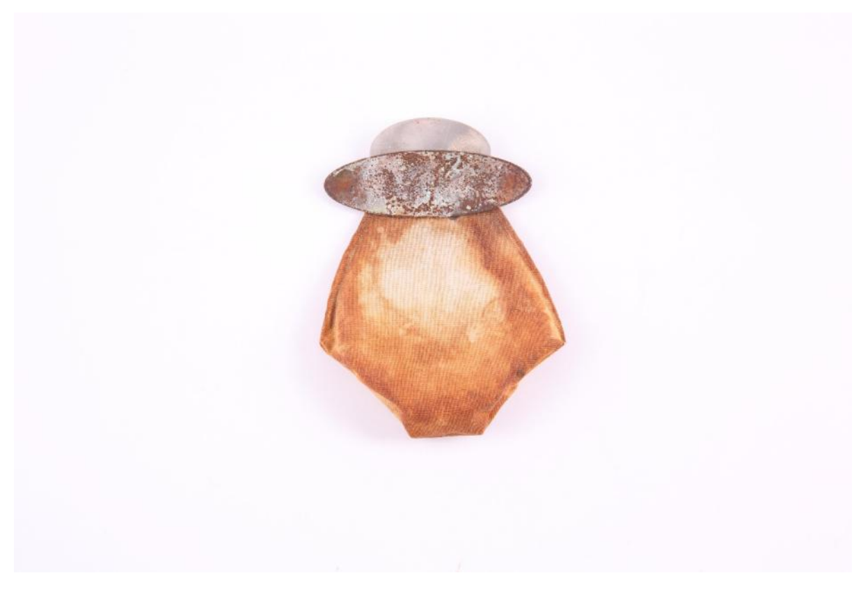
Figure 10. Joani Groenewald, Teesakkie #1 (2013). Brooch: Antique napkin, silver, rooibos tea. Digital photograph.