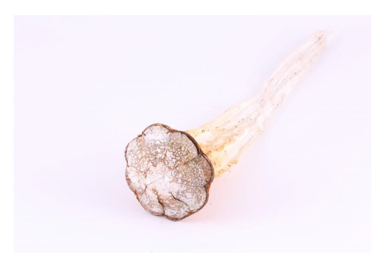
Figure 22. Joani Groenewald, Object (2014). Enamel, silver, copper, linen and rooibos tea. Digital photograph.