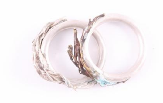
Figure 14. Joani Groenewald, Rings (2013). Silver and brass. Digital photograph.