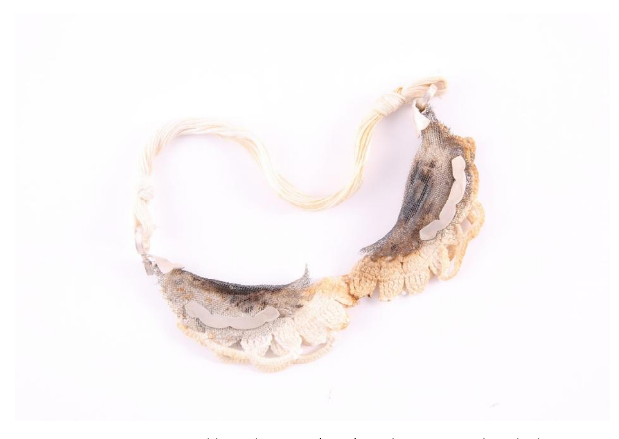
Figure 12. Joani Groenewald, Borslappie #2 (2013). Neckpiece: Lace, thread, silver, tea strainers. Digital photograph.