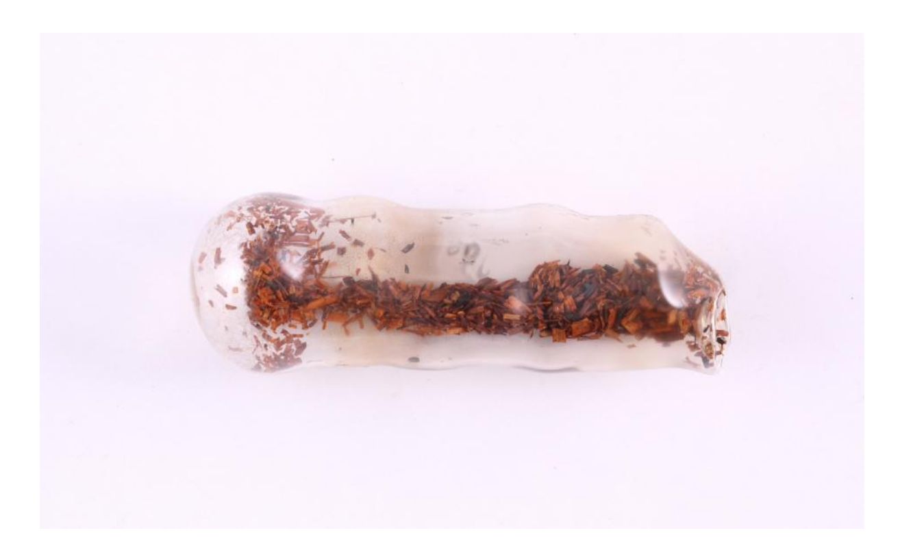
Figure 20. Joani Groenewald. Rooibos #3 (2014). Glass Rooibos tea. Digital photograph.