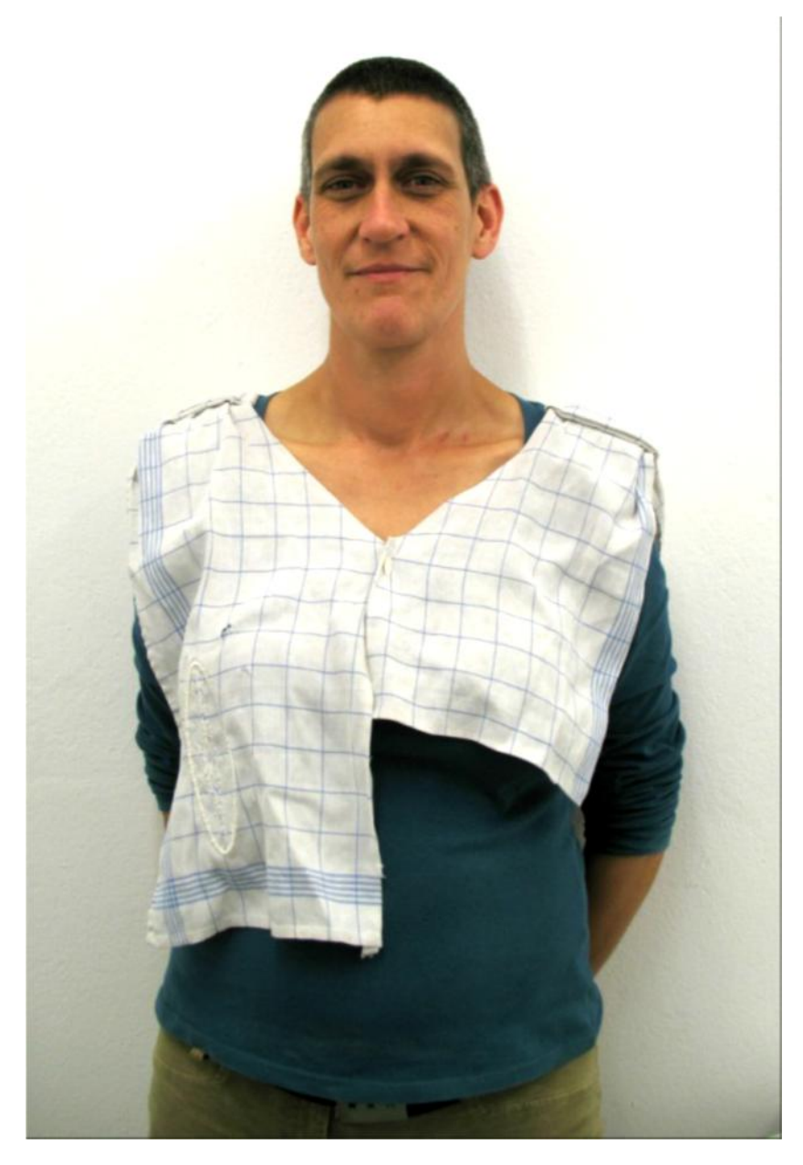
Figure 29 . Nini van der Merwe, Blue and white #3 (2012). Cotton, silk thread, sterling silver. (Van der Merwe 2013).