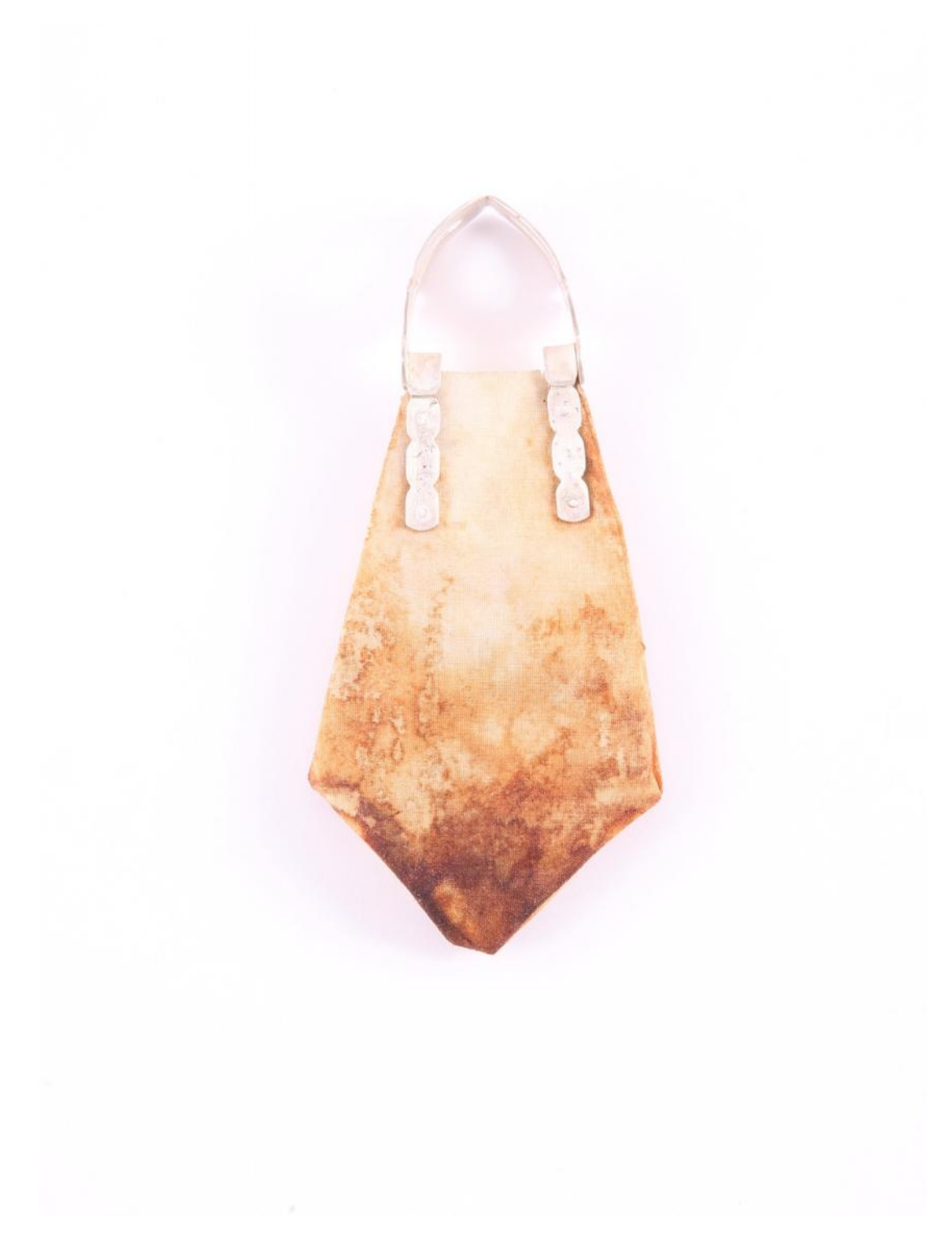
Figure 8. Joani Groenewald, Teesakkie #1 (2013). Pendant: Antique napkin, silver, rooibos tea. Digital photograph.