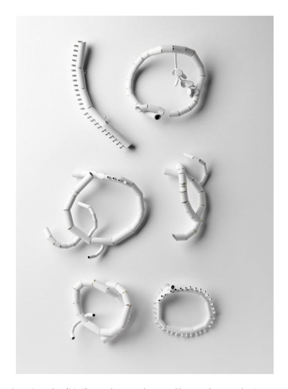
Figure 37. Xylem (2013). Brooches: Powder coated brass and copper chenier vary. (Jess Dare [Online]).