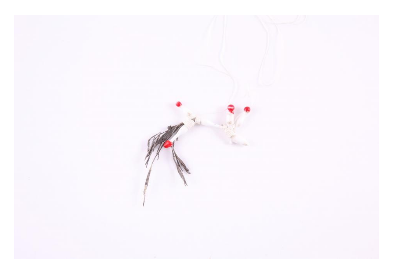
Figure 17. Joani Groenewald, Object (2014). Silver, thread and lamp work glass. Digital photograph