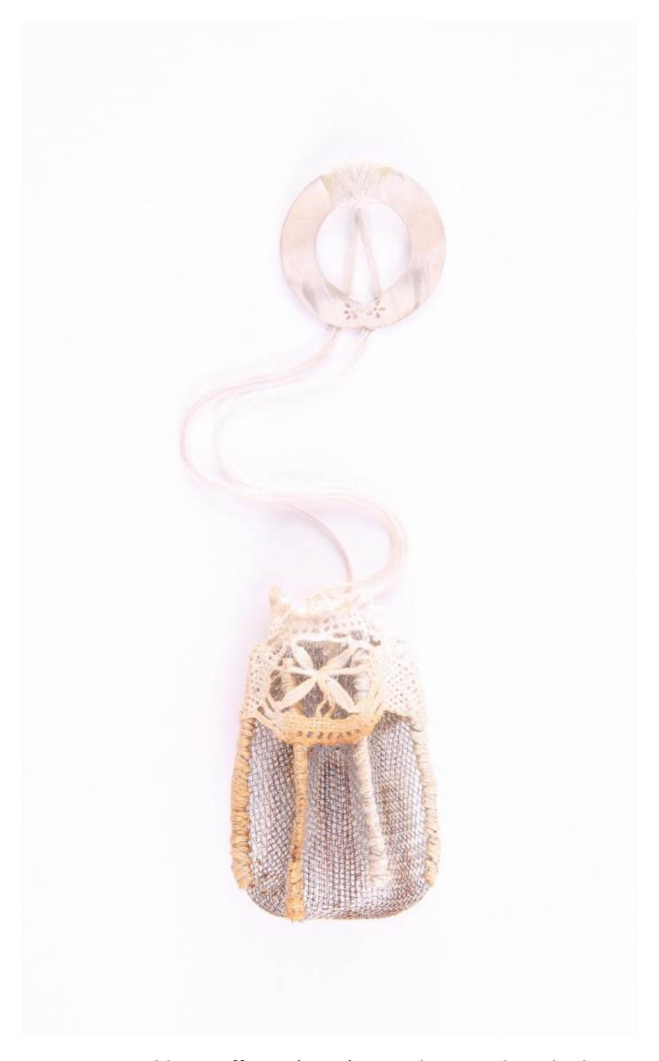
Figure 4. Joani Groenewald, Teesiffie #1 (2013). Brooch: Lace, thread, silver, tea strainer, rooibos tea. Digital photograph.