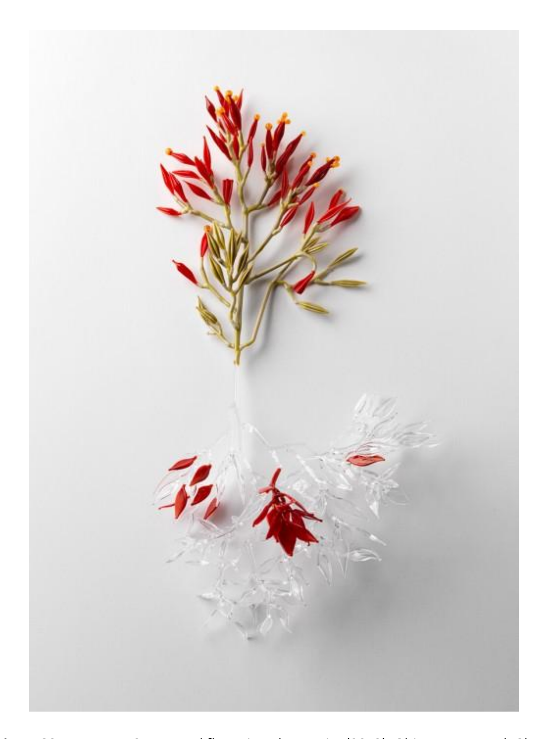
Figure 30: Jess Dare. Conceptual flowering plant series (2013). Object: Lampwork Glass. Photography by Grant Hancock. (Jess Dare [Online]).