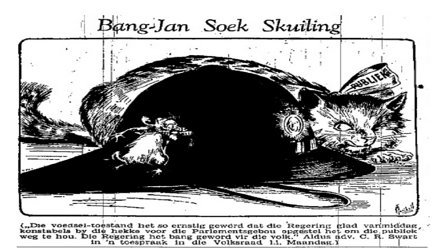
Figure 1: A comic which appeared in Die Burger which depicts the public discontent with the current food situation and the Prime Minister is shown to be a scared mouse hiding from the wrath of the public. The comic's translated title is "Scared Jan (Smuts) tries to hide." The Caption is an extract from a speech made by C. R Swart in parliament. It translates to: "The food situation has become so dire that the Government had to place constables at the gates this afternoon to keep the public out. The Government is scared of the people." <sup>115</sup>

"The first thing that we must all realize and face is that it just is not possible for us to have all we want because the shipping is not available. We are therefore, compelled to cut our coat according to our cloth. It is General Smuts' desire that the restricted supply be carried out in such a manner as to cause the least amount of economic dislocation possible under the circumstances and that where hardships must perforce be suffered, such suffering shall be equitable. We admit that in the past there has been a considerable amount of complaint and criticism-some of which was justified...No doubt some complaints and criticism were due to a lack of appreciation of the seriousness of our civilian supplies position...Here let me say that the path of our controllers has certainly not been a bed of roses. I believed they have accomplished a great deal and have rendered the Government and the Country signal services under what must been extremely trying."<sup>114</sup>