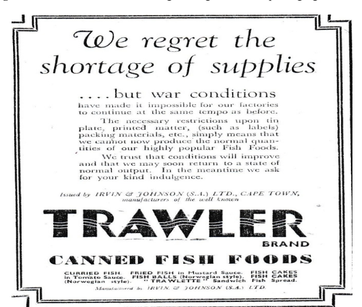
Image 2.1: Advertisement announcing shortage of tin and packaging materials. <sup>43</sup>

The canning industry was entirely dependent on the overseas supply of tinplate and of highly specialised food machinery. As tinplate was rationed, the can-making industry improvised in creative ways, evolving an alternative paper and metal container that attempted to meet the needs of the jam industry. Innovation went some way towards reducing the severity of the manufacturing problem.<sup>44</sup>