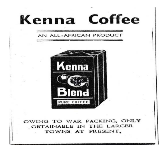
Image 3.2: Luxury items such as Coffee were difficult to obtain outside of urban centres.<sup>99</sup>

Adaptation to shortages involved substitution. In South Africa, a coffee substitute in the form of chicory root began that was used more and more extensively, as it was produced domestically and could be mixed with low-grade coffee. Further chicory imports were controlled by the Food Controller along similar lines to those of rice and tea.<sup>98</sup>.