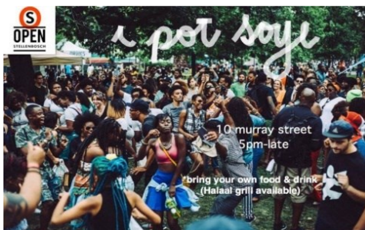
Figure 2: Ipotsoyi Party event post (OS,2016d).