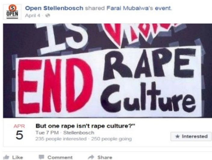
Figure 1: End Rape Culture event post (OS,2016a).

Stellenbosch page on Facebook, these posts generally provide information on the time, date and venue for the concerned event - a function that traditional media shares with social media (Steenkamp and Hyde-Clarke, 2012). Furthermore, there is often an option to indicate whether one will be attending the event or has interest in joining the event. At its most basic, the ability to indicate attendance on the forum itself, in real time, highlights the interactive potential that distinguishes social media from tradition media forms such as newspapers and television (Lovink, 2011). Event posts typically look like this: