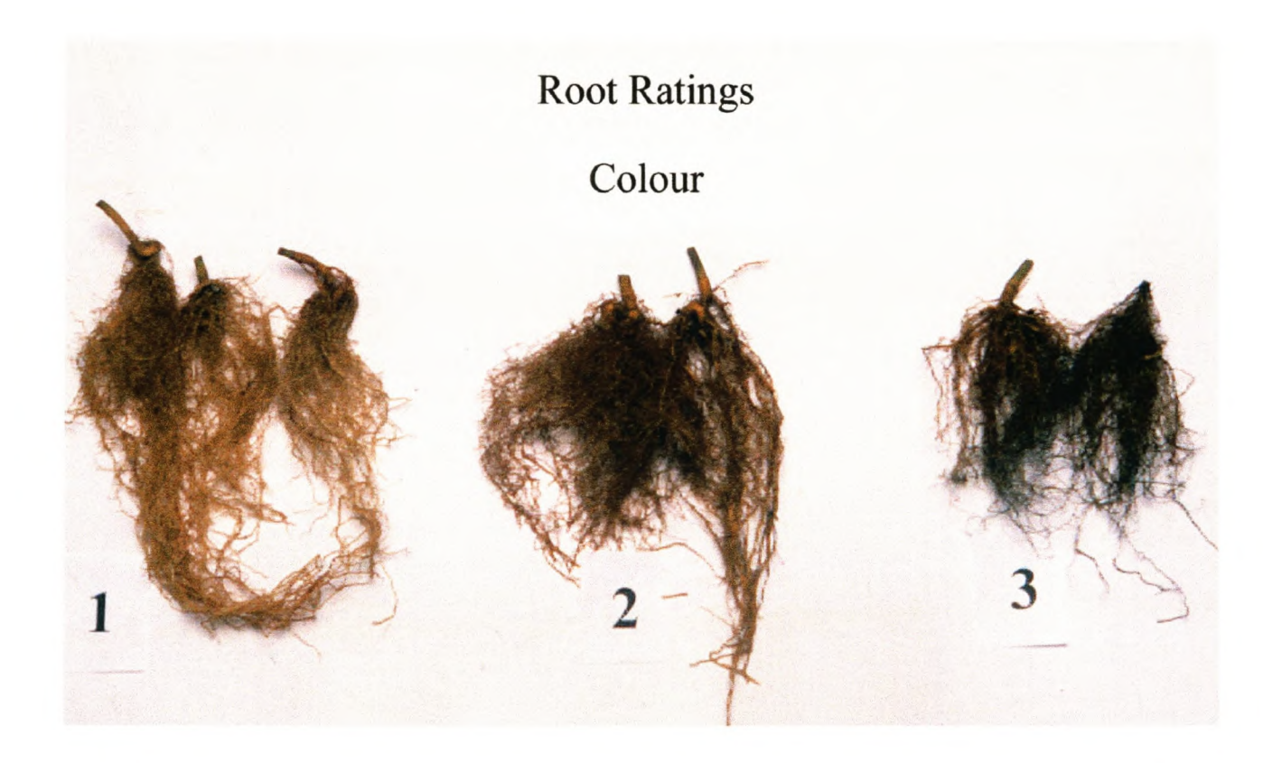
FIGURE 1. Rating system used to assess discolouration caused by apple replant disease. Roots were rated on a scale from 1 to 3, where 1 = white, healthy roots and 3 = severely discoloured, necrotic roots.