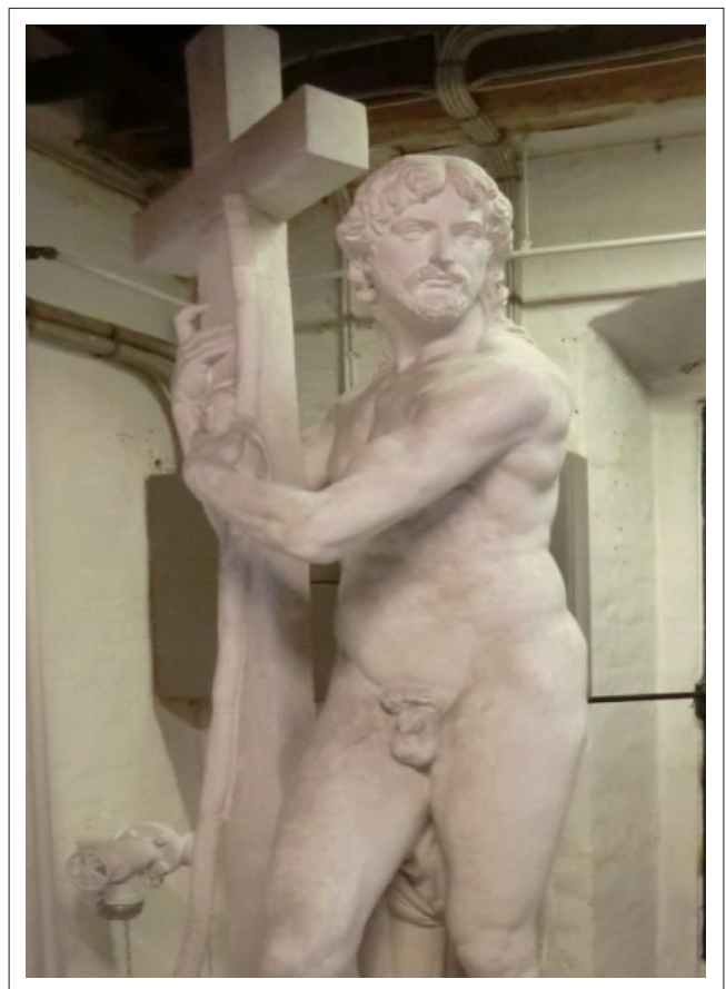
Source: Permission from Royal Cast Collection, Copenhagen. Photo taken by: D.J. Louw, 2013 Note: The human body is now transferred into the aesthetics of immortality and eternity beyond the discriminating and stigmatising categories of culture and social imaging.