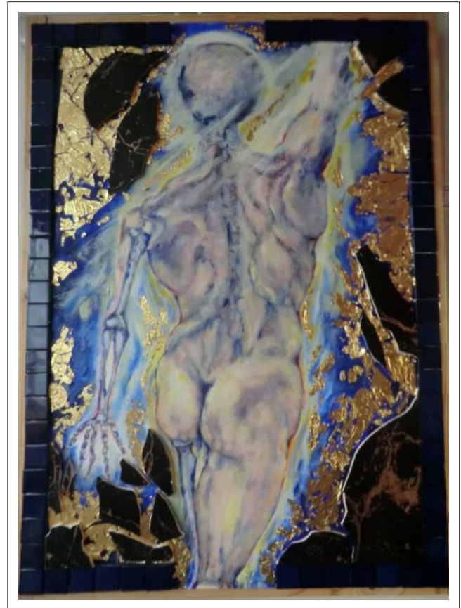
Source: Icon by D.J. Louw, Chapel Faculty of Theology, University of Stellenbosch. Photo taken by: D.J. Louw, 2013

The practical implication of the perfectum , praesens and futurum of eschatology is the creativity of imagination. To recall the cross and the resurrection is to 'envisage' a