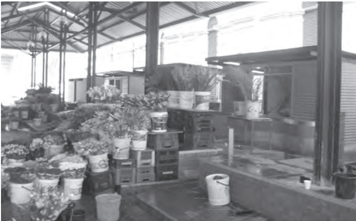
Figure 7: The new storage facilities in Trafalgar Place

... [i]ncorrect info & requests by certain flower sellers caused unhappiness amongst them. Chairman also explained the TPFs is a heritage place, and that nobody other than the flower sellers together with the committee can make changes concerning the trading on the market. 51