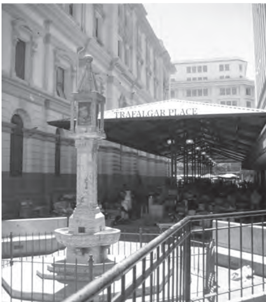
Figure 2: Trafalgar Place flower market in Adderley Street (Flower Sellers’ Alley), with the monument to Archdeacon Lightfoot. (Photograph: L. Rabe, 2010)