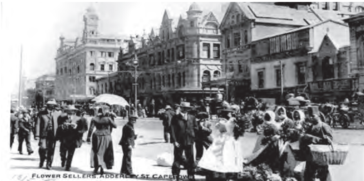
Figure 3 (Top): Adderley Street’s flower sellers, probably in the early 1900s