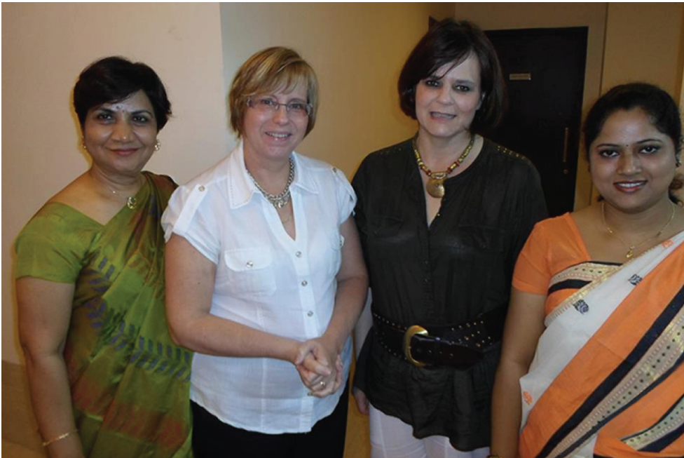
With colleagues during a meeting on an OA curriculum for UNESCO, New Delhi, India, 2013.

98 International Open Access Week, presented during October. I have already started planning what to do this year, and am always looking for new ideas and ways to further promote open access. There is such a need for expertise, and I gladly share my knowledge and experience when invited to present at conferences, present workshops or when visitors want to come and visit and learn from me. I always learn from them too, and am so thankful for such wonderful opportunities! A recent highlight was participating in authoring a chapter on OA infrastructure for an OA curriculum to be published by UNESCO to be implemented and used by librarians and library schools from all over the world. It is also a privilege to 'give back' to the library profession by serving as deputy chair of the Higher Education Library Interest Group (HELIG) of the official body for librarians in South Africa, the Library and Information Association of South Africa (LIASA). Recently I had to assist with a webinar on library orientation, and it was an eye-opener to see how responsive people are within an online real-time environment.