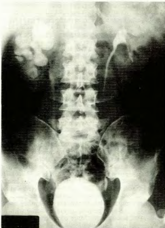
FIG. 2. Intravenous pyelogram showing marked cavitation and clubbed calyces of the right kidney.

Almost all patients underwent medical therapy with isoniazid, rifampicin and pyrazinamide, usually for 6 months. Only occasionally was alternative antituberculosis therapy used. We encountered no resistant organisms but a lack of patient compliance leading to 'recurrence' was common, often requiring longer courses of treatment.