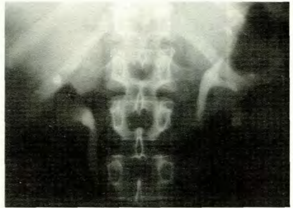
FIG. 1. Intravenous pyelogram showing apparent diverticulum of lower pole calyx on the left. Patient had confirmed genito-urinary tuberculosis, so this must be considered early cavitation.

A histological examination was performed in 35 patients (67%) but proved the diagnosis (typical histo-