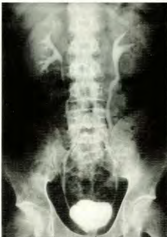
FIG. 4. Intravenous pyelogram reported as normal, but note the missing lower-pole calyx on the left when compared with that on the right.

Thirty of our patients (58%) required some form of surgery, either radical extirpative, reconstructive or diagnostic only. Some patients had more than one operation. Twenty-three patients (44%) underwent extirpative procedures, including 17 nephrectomies, 4 orchidectomies and 1 epididymectomy. Eight patients (15,4%) underwent reconstructive procedures, namely 4 augmentation cystoplasties, 2 ileocolicostomies, 1 reimplantation of the ureter and 1 pyeloplasty. Three patients required surgery purely for diagnostic purposes.