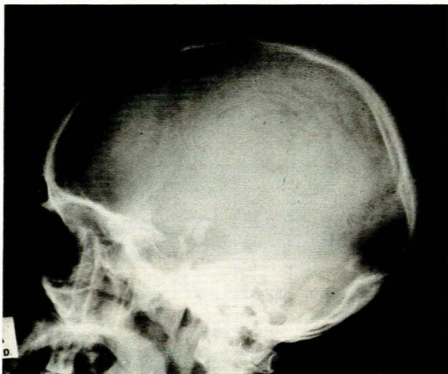
Fig. 3. Skull radiograph showing bean-shaped calcifications.

Routine blood studies and chest radiographs were normal. Skull radiographs showed the presence of two oval, bean-shaped calcifications on the lateral views. These were situated slightly above and behind the posterior clinoid processes (Fig. 3). The blood glucose level was 4,8 mmol/l (fasting) and cholesterol 4,96 mmol/l. The Wassermann reaction was negative. Lumbar puncture revealed a protein level of 0,5 g/l but was otherwise normal, while tests for syphilis were negative. Biochemical values and the protein electrophoretic pattern were normal. The effective thyroxine index was 0,94 (normal 0,86 - 1,13) and the fasting lipogram was normal. An electro-encephalogram (EEG) showed irregular 9 - 10 cycles/s alpha rhythm. Irregular continuous 3 - 6 cycles/s waves with low amplitude were also present in the left temporal recording, and were thought to reflect nonspecific organic changes. Computed tomography confirmed the presence of dense calcifications on the antero-medial aspects of both temporal lobes, thought to represent calcification in both hippocampi. The brain substance and ventricular systems were normal. A biopsy specimen of one of the skin lesions on the hands demonstrated histological changes consistent with lipid proteinosis.