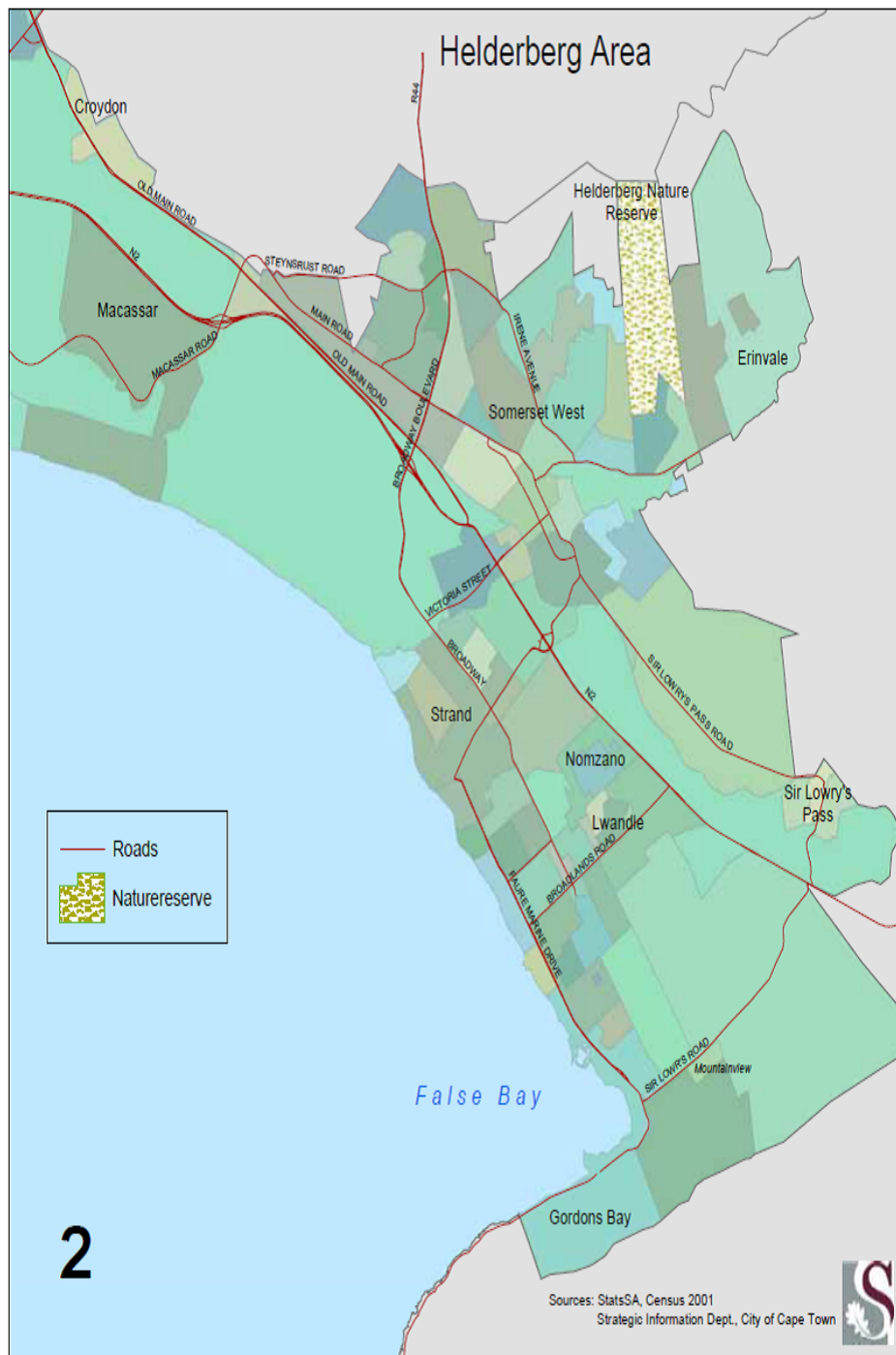
Map 1: Map of the Helderberg Basin, 2005 55

predominantly white owned and occupied. Map 1 below illustrates the different areas of the Helderberg Basin.