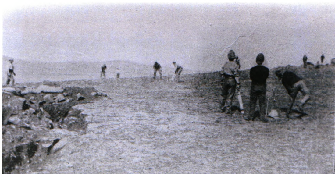
Figure 6: British troops playing cricket whilst on active duty in the veldt.