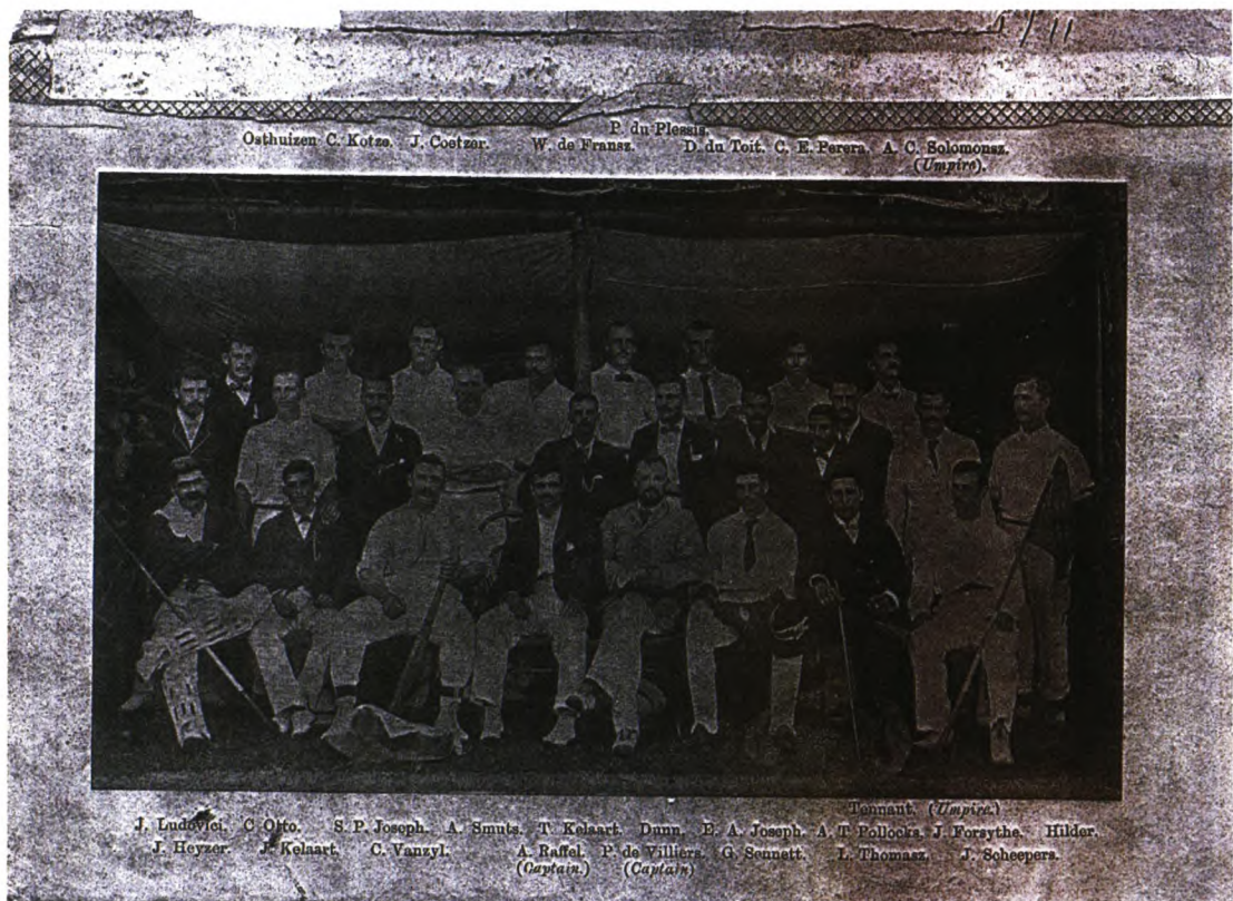
Figure 20: Boer prisoners of war and the Colombo Colts. Ceylon, July 1901.