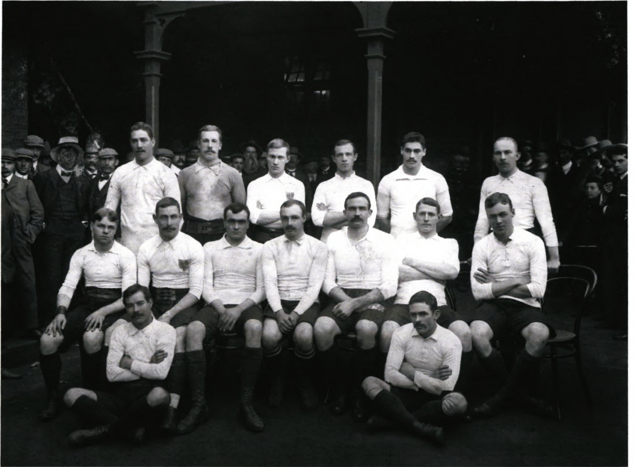
Figure 26: The South African Team. Johannesburg, 26 August 1903.