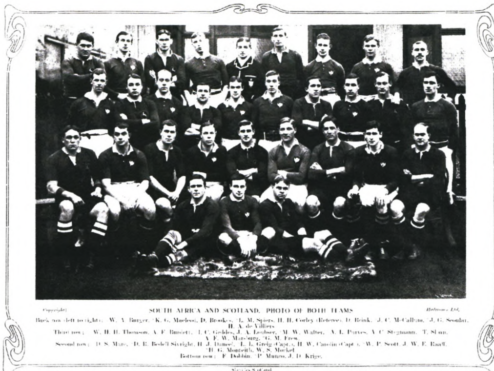
Figure 29: South Africa and Scotland. Edinburgh, 17 November, 1906.