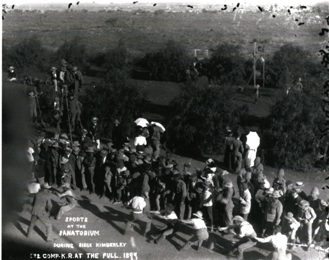
Figure 4: Sports at the Sanatorium during the Siege of Kimberley, 1899.