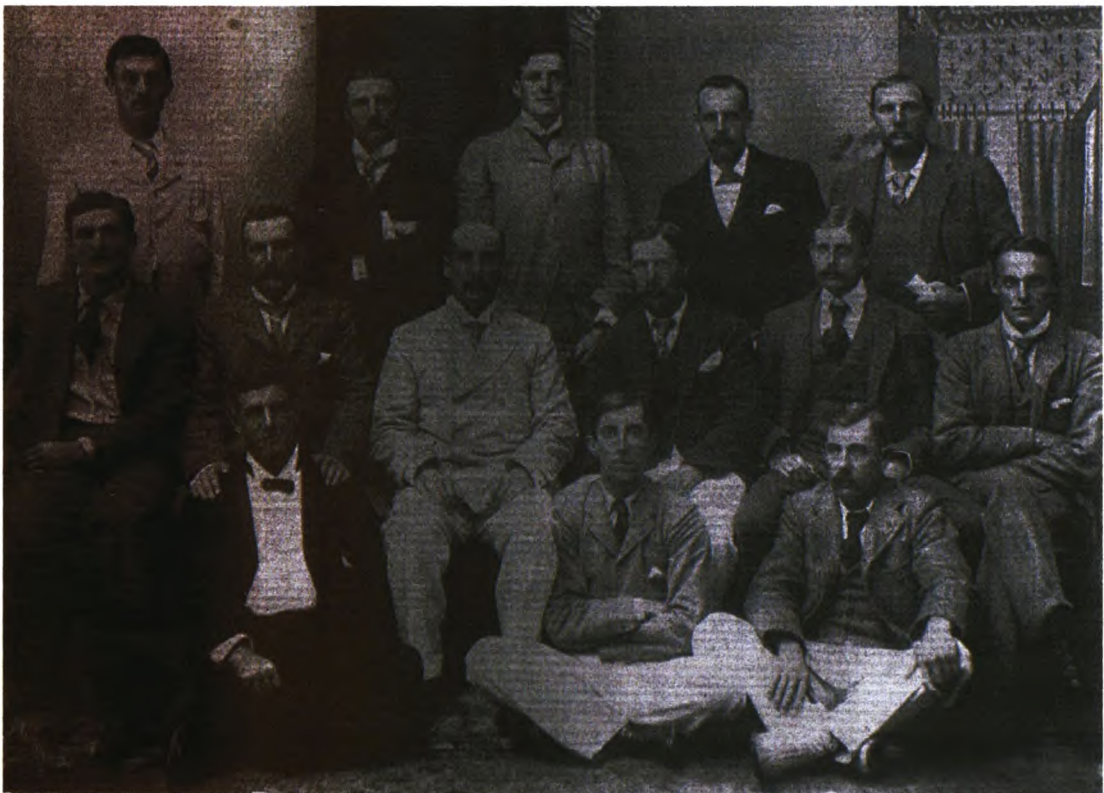
LORD HAWKE'S FIRST ENGLISH TEAM.