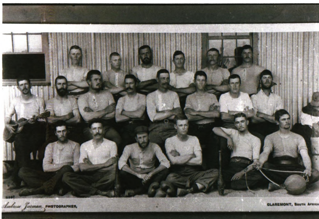
Figure 11: The Boxing Club, Greenpoint. Prisoner of War Camp.