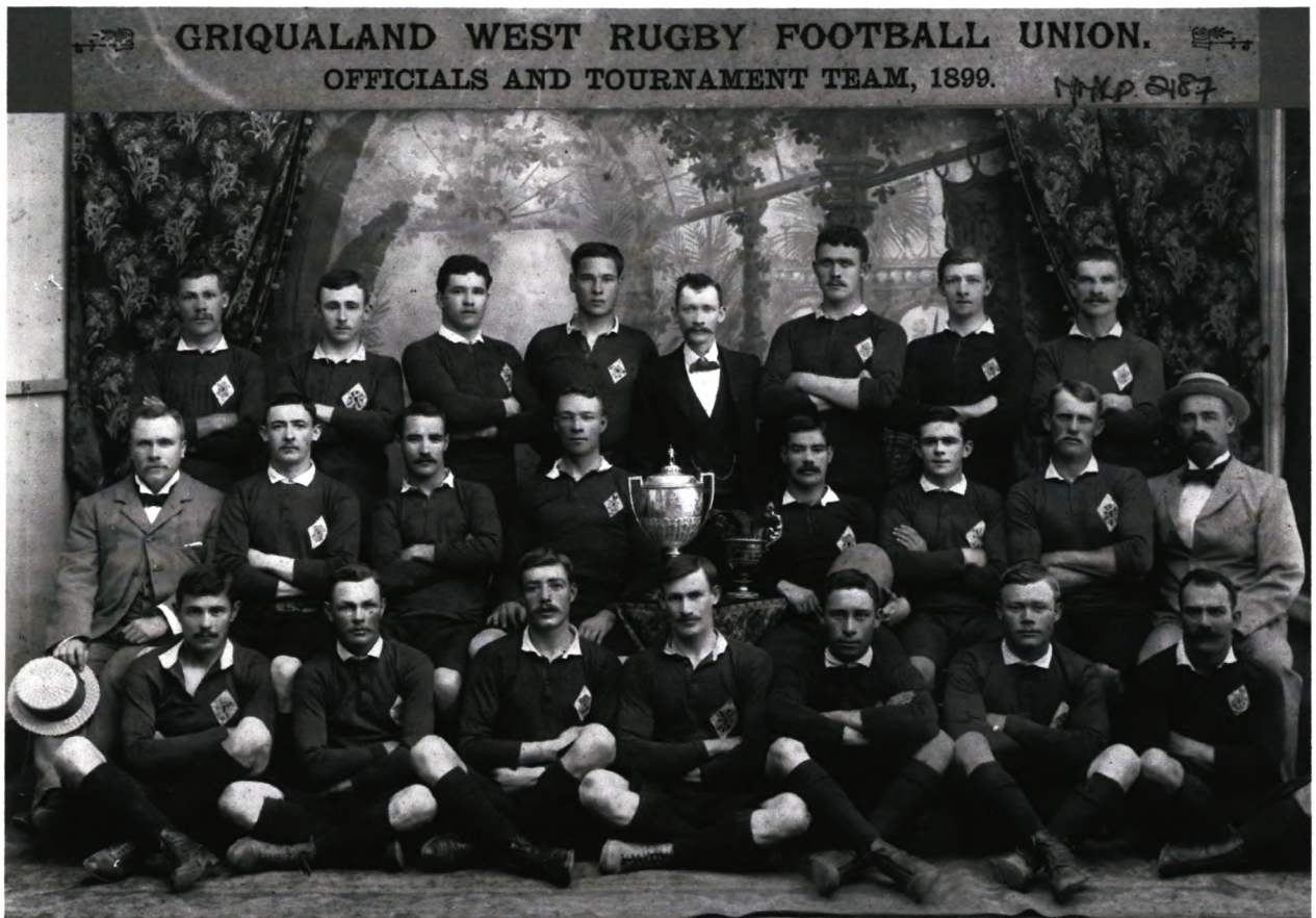
Figure 24: Griqualand West Currie Cup Team, 1899.