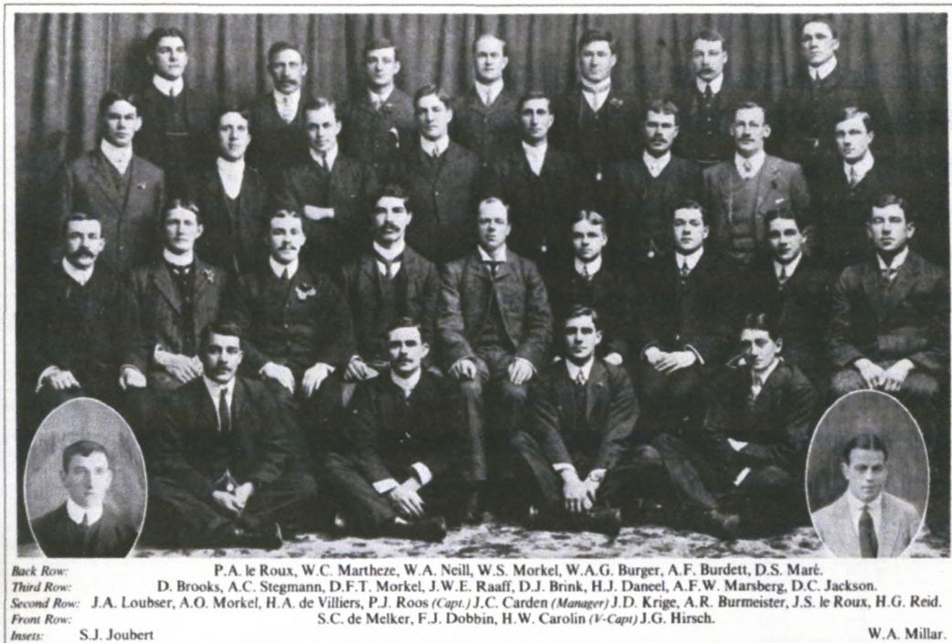
Figure 28: The 1906 Springboks.