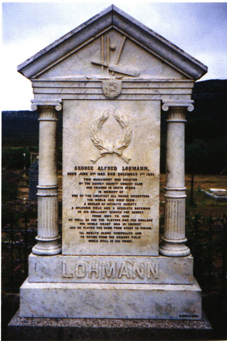
Figure 22: The grave of G. A. Lohmann, Matjiesfontein.