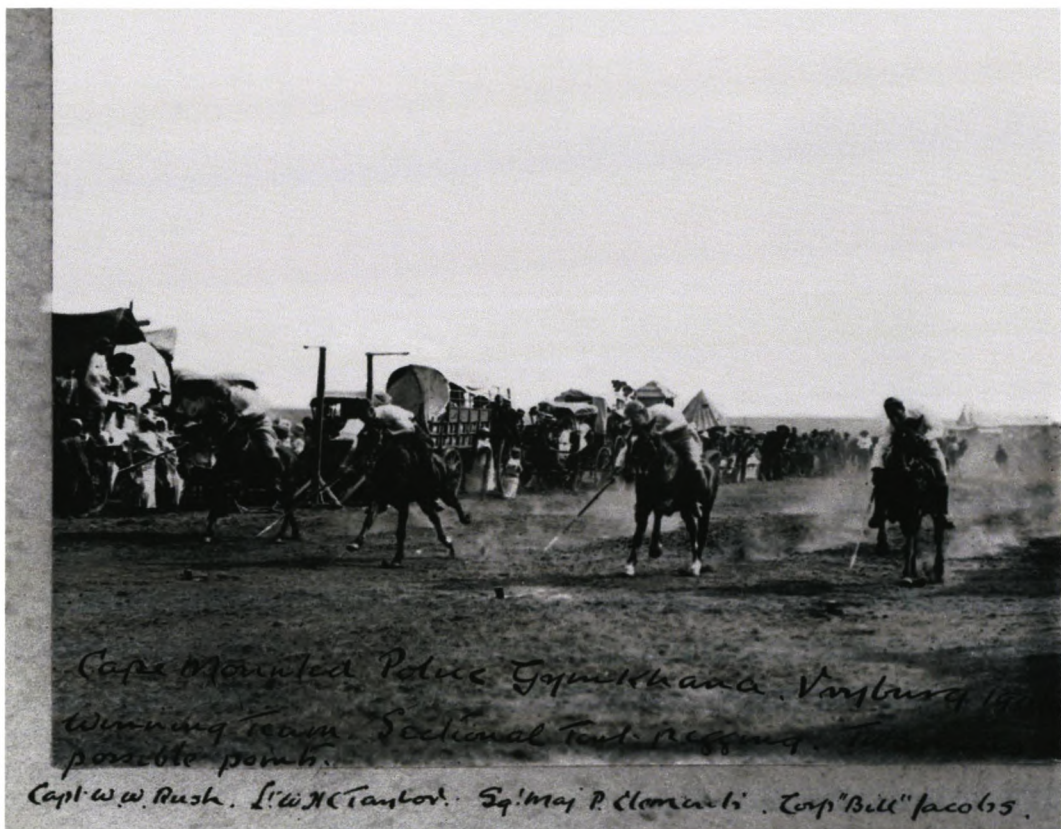
Figure 3: Cape Mounted Police Gymkhana. Vryburg, 1901.