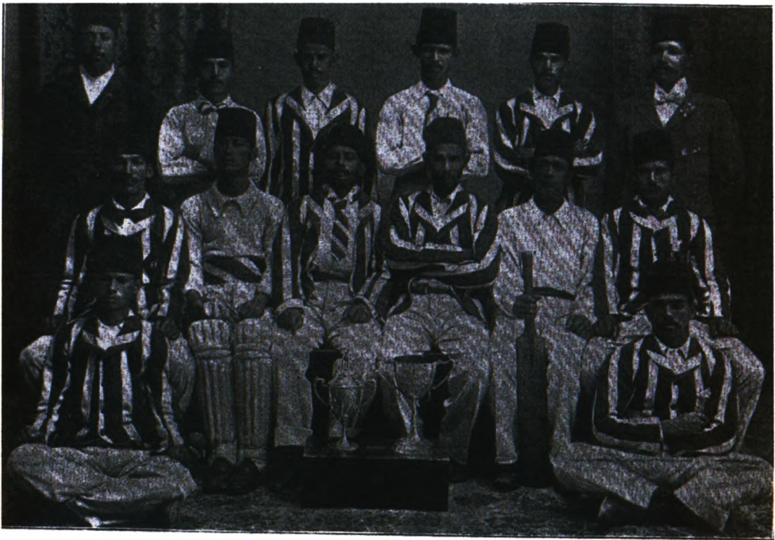
A MALAY CRICKET CLUB: THE RED CRESCENTS.