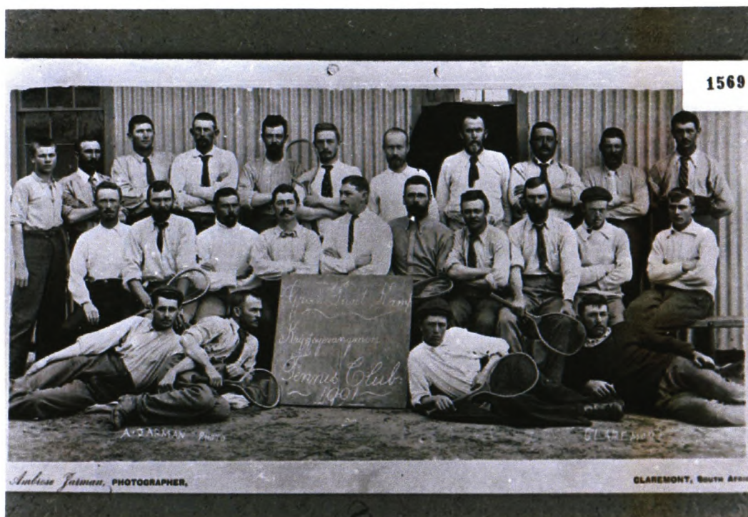
Figure 9: Prisoner of War Tennis Club. Cycle Track Camp, Greenpoint, Cape Town. November 1901.