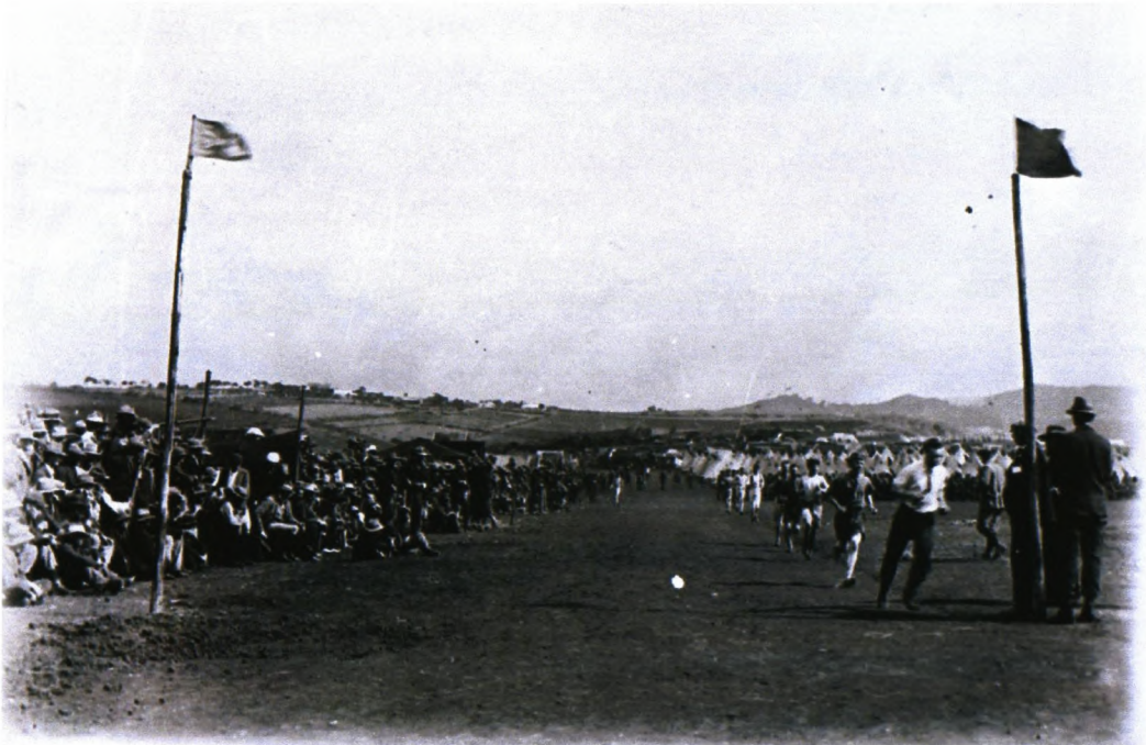
Figure 14: The one-mile race. Deadwood Camp, 27 March 1902.