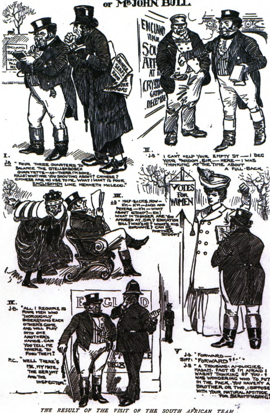
Figure 30: The result of the visit of the South African Team