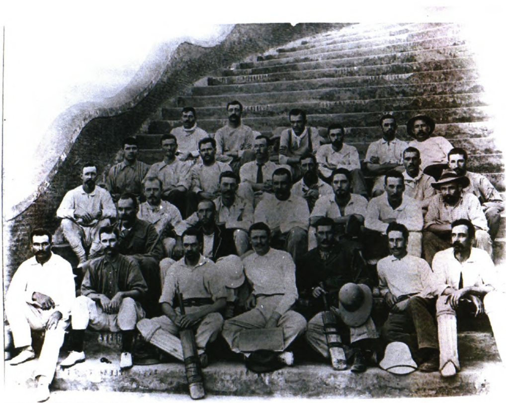
Figure 13. The Ahmednagar Boer Cricket Club.