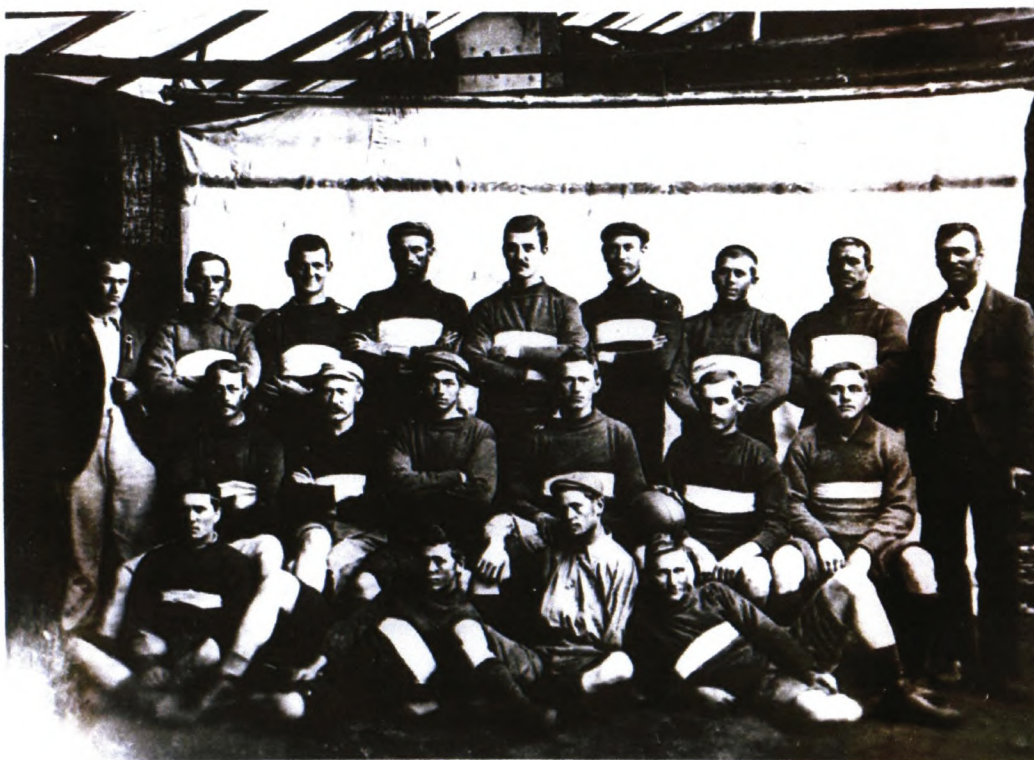
Figure 12: Deadwood Prisoner of War Camp, St. Helena. Rugby Team, May 1900.