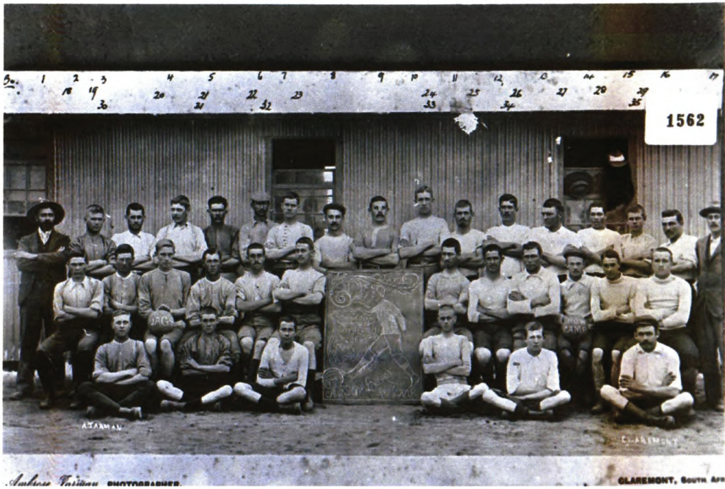
Figure 10: Soccer players of Greenpoint Prisoner of War Camp.