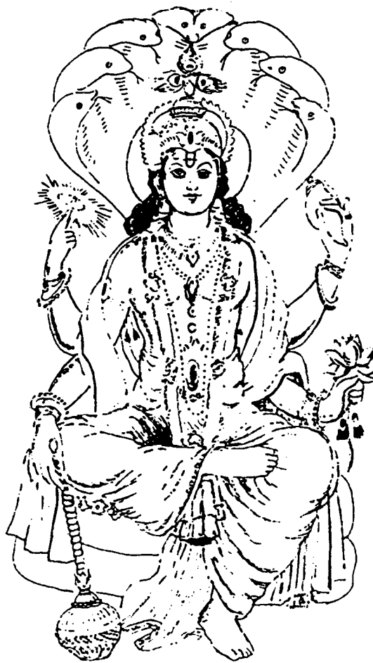
Lord Vishnu and his attributes