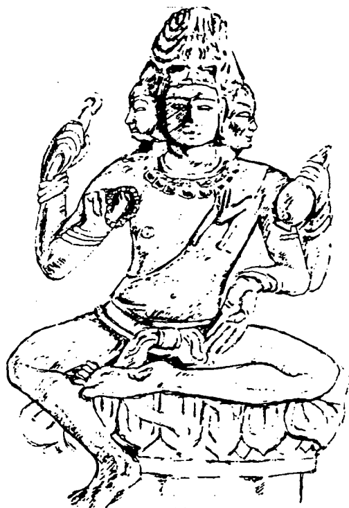
Brahma the creator, facing four directions.