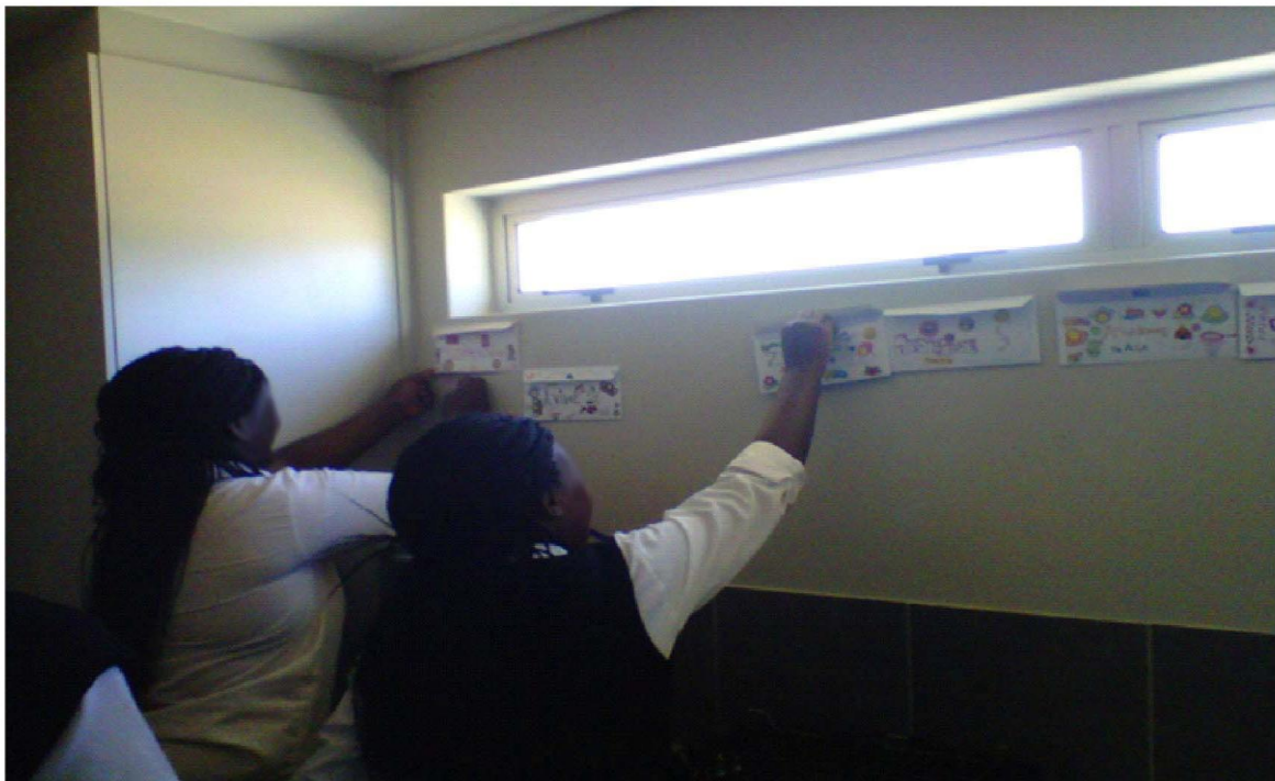
Above: WGILS posting notes of encouragement into the envelopes