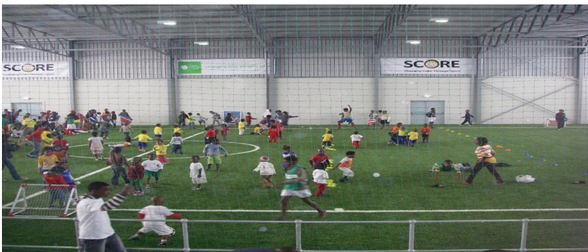
Above: An internal view of the Mbekweni Community Sport Centre