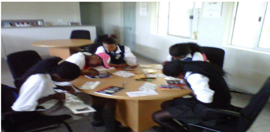
Above: WGILS hard at work during a life skills session

The WGILS programme is a leadership programme for women and girls that looks to encourage and engage young women and girls in life skills and sport activities. Theokas et al. (2008:72) define life skills as “those skills that enable individuals to succeed in the different environments in which they live, such as school, home and in their neighbourhoods and with their peer groups. Lifeskills can be behavioural (taking turns) or cognitive (making good decisions); interpersonal (communicating effectively) and intrapersonal (setting goals)”. In addition to the life-skills component of the programme, the WGILS programme also seeks to begin to address the disproportional lack of girls that participate in sport by introducing the participants to an assortment of sport codes through short sport courses. Meier (2005:5) asserts that “sporting activities can give women and girls access to public spaces allowing them to gather together, develop a social network, meet with peers, discuss problems, and enjoy freedom of movement on a regular basis.” The WGILS programme and the physical space of the MCSC offers the participants of the WGILS programme a space to increase their social networks and in doing so reap the benefits that spring from the accumulation of social capital in the form of trust, reciprocity and future benefit.