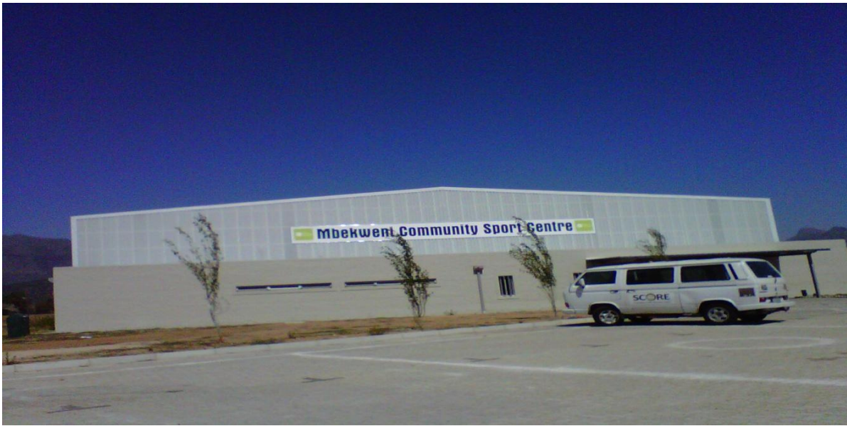
Above: An external view of the MCSC from the parking lot