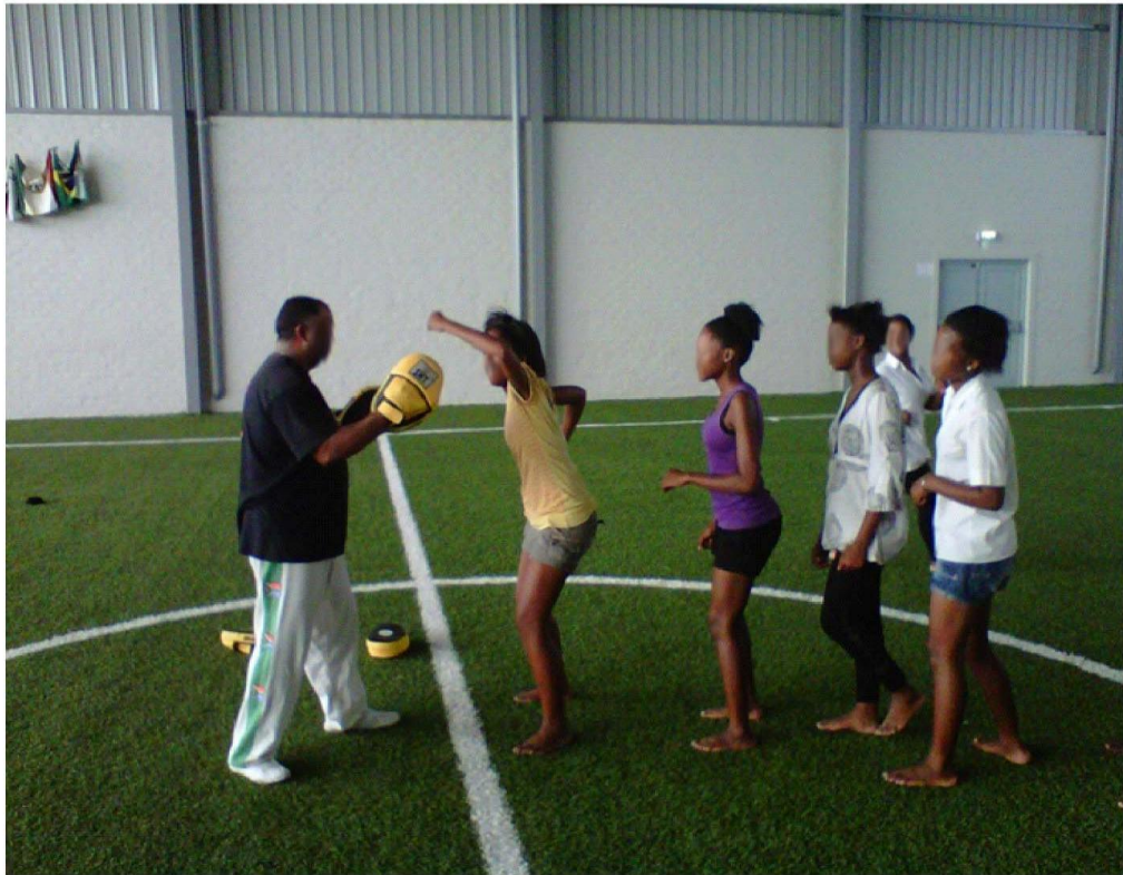
Below: Kickboxing activities during the WGILS sessions