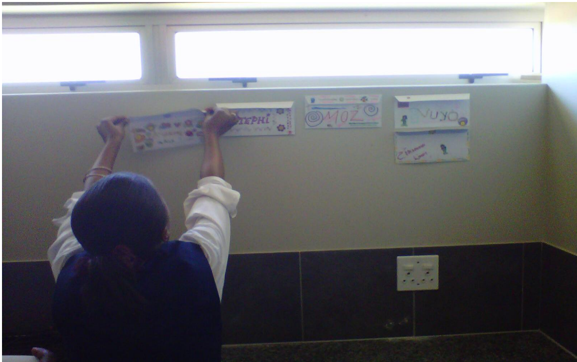
Below: One of the WGILS putting up her 'envelope'