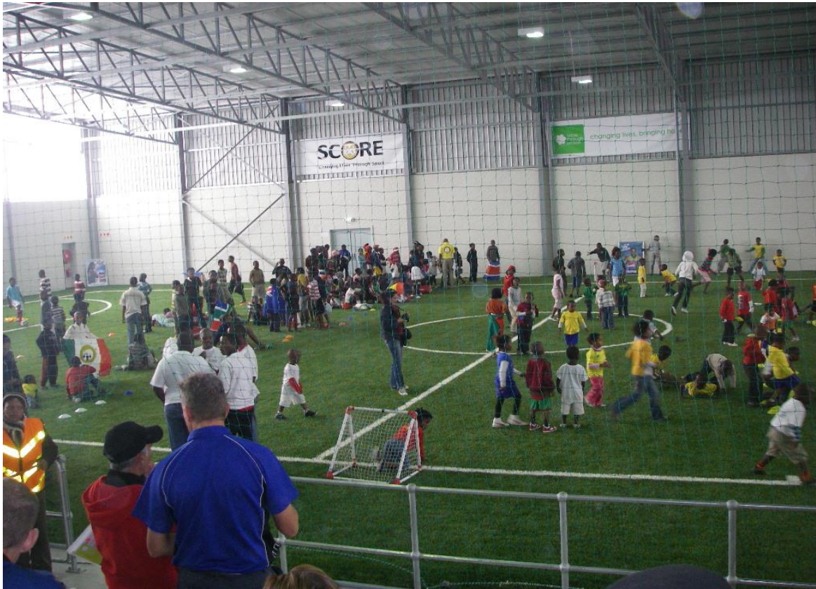
Above and below: A mini-futsal tournament was held where teams represented the countries participating in the 2010 FIFA World Cup.