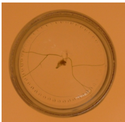
Figure 3.1: When rye was used as a female parent only minimal root growth was observed.

In crosses where rye was used as the male parent the F_1 hybrid emergence was higher when wheat was used as the female, however the F_1 hybrid emergence was significantly different for all crosses ( p < 0.05 ). When 'US1010' was used as the female parent the F_1 hybrid emergence was 12.4% and 48% when 'US3010' and 'Duiker' were used as the male parents. When 'SST88' was used as the female parent the F_1 hybrid emergence was 11.1% and 27.6% when crossed with 'US3010' and 'Duiker'. The high F_1 hybrid emergence was expected when 'SST88' (female) was crossed with 'Duiker' (male) as the amount of embryo formation was not significantly different from the control cross. The highest F_1 hybrid emergence (48%) was obtained from crosses between 'US1010' (female) and 'Duiker' (male). From the results of the chi-square analysis, the F_1 hybrid emergence was however expected to be lower as the amount of embryo formation was significantly different from the control cross.