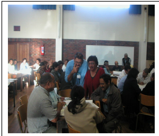
Fig 4.5: Teachers at the Science Curriculum Workshop 26 May 2004.

At this meeting envisaged for the new term further activities will also be finalized. Efforts will be made to link further work with the formal training intermediate phase teachers have done with WCED officials during the June vacation.