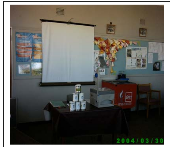
Fig 4.1: SWAP display at initial workshop.

six each with two teachers Mike Henry (Delta) and Mike Haeger (Square Hill) to lead clusters. It was also agreed that grades 6 & 7 would be the focus of the programme.