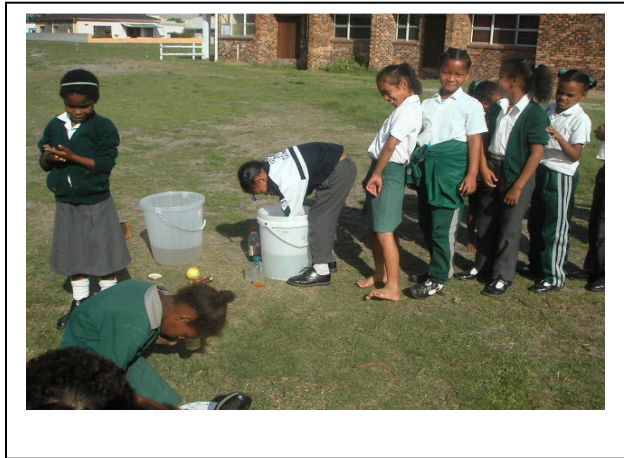
Fig.4 6: Children performing SWAP tests on fieldtrips