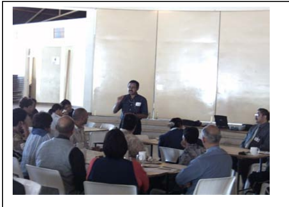
Fig 4.2: Facilitators addressing teachers at workshop.